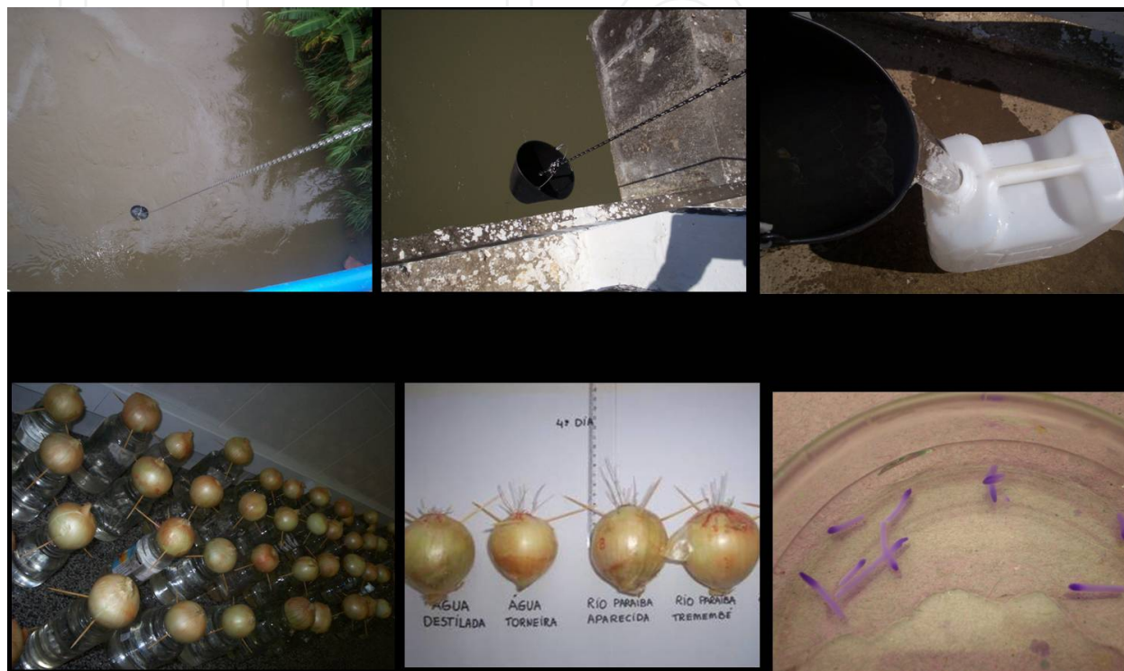
Figure 3. Allium cepa bioassay: a 20 L bucket was used for collecting the samples and transferred to 40 L containers (up); bulbs were exposed to treatment for 24 hours; growth root and root stained with Schiff (down).

studies to evaluate the potential damage inflicted by pollutants in aquatic environments. Furthermore, even one bulb and one root per bulb was sufficient in discerning this damage, thereby shortening the time required to attain a statistically confident comparative evaluation. However, to allow for the use of statistical programs based on the evaluation of average values, and to avoid criticism based on genetic variability, we propose that three bulbs and three roots per bulb be considered as standard sample sizes for the A. cepa test [46].