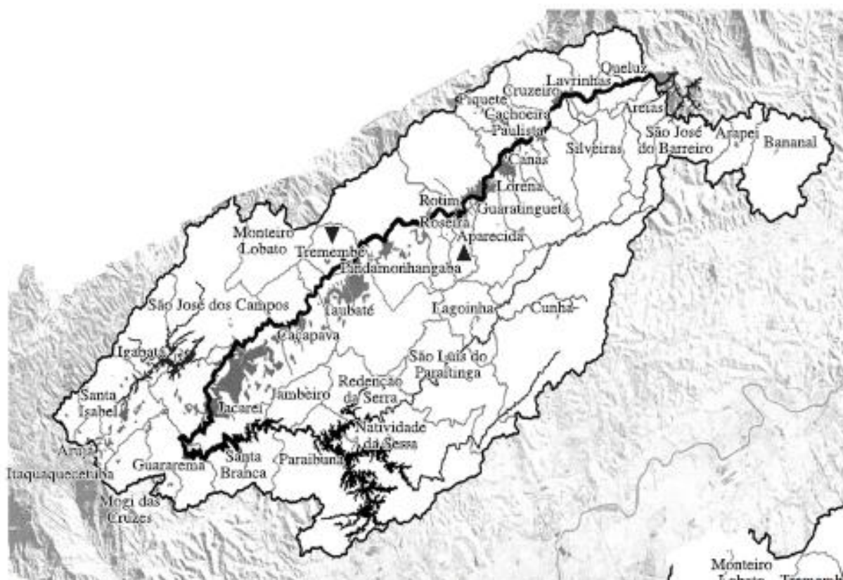
Figure 4. Indication of the cities (Tremembé and Aparecida) ‘triangles’ at which the water was sampled from the Paraíba do Sul river [19].

The Paraíba do Sul river (Figure 4) is one of the components of the Paraíba do Sul basin, of importance to the southeast region of Brazil, as it serves for urban supply, irrigation, generation of energy, and assimilation of urban, industrial and agricultural discharges in the mentioned region. For this reason, since 2005, samples of water of this important river, collected in cities along its course, have been periodically evaluated. Anatomo-morphologic parameters (root growth), mitotic indices (MI), cell division phase indices (PI), frequency of micronuclei (MN) and chromosome anomalies (CA) are investigated.