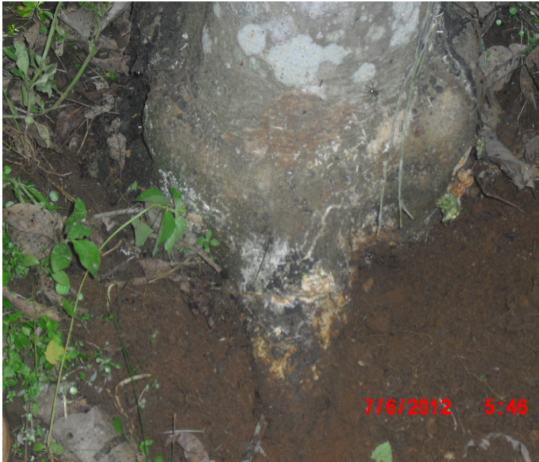
Figure 2. Rhizomorph strands on the collars of root of Hevea tree.