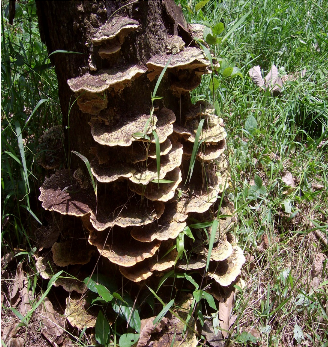
Figure 1. Basidiocarps of R.lignosus on dead Hevea tree.

while. Distinctive features of fructification (basidiocarps) (Fig.1), show the upper surface of concentric zones that is brownish-orange with a bright yellow margin when fresh, while the lower surface is reddish-brown.