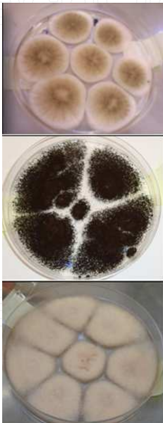
Figure 2. Fungal strains from air samples in Valle de las Palmas, Mexico.

Microorganisms are frequently considered passive habitants of the air, dispersing via airborne dust particles (Figure 2). However, latest studies suggest that many airborne microorganisms are metabolically active, even up to altitudes of 20,000 m. Also, it has been suggested, that some airborne microbes may modify atmospheric conditions [9].