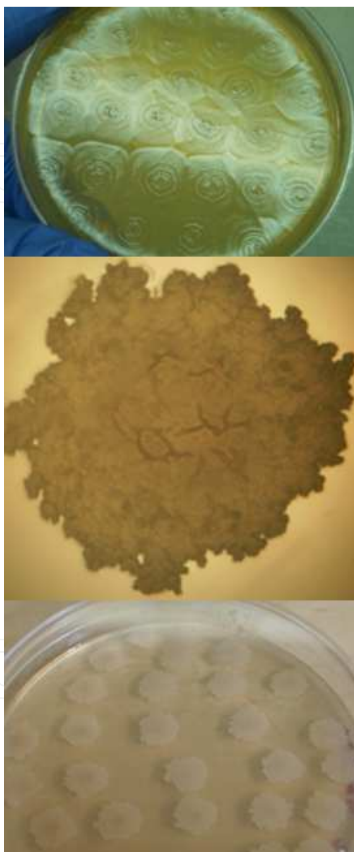
Figure 3. Bacteria strains from soil samples in Valle de las Palmas, Mexico.