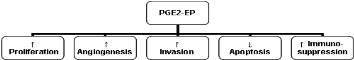
Figure 2. PGE2 in carcinogenesis