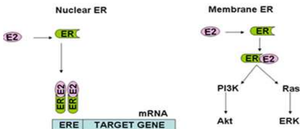
Figure 4. Estrogen Receptor fuction: Genomic (Nuclear ER) and Non Genomic (Membrane ER) action

estrogens. The human CYP19A1 gene, located in the 21.2 region on the long arm of chromosome 15 (15q21.2), spans a region that consists of a 30 kb coding region and a 93 kb regulatory region. Its regulatory region contains at least 10 distinct promoters regulated in a tissue- or signalling pathway-specific manner. Each promoter is regulated by a distinct set of regulatory sequences in DNA and transcription factors that bind to these specific sequences. These partially tissue-specific promoters are used in the gonads, bone, brain, vascular tissue, adipose tissue, skin, foetal liver, and placenta for estrogen biosynthesis necessary for human physiology (Bulun et al., 2004). Estrogens contribute to differentiation and maturation in normal lung (Patrone et al., 2003) and also stimulate growth and progression of lung tumors (Stabile et al., 2002; Pietras et al., 2005). Two major pathways, generally termed genomic and non-genomic, are known to mediate estradiol effects on cells. (Fig.4)