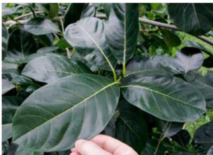
Figure 1. Mature leaves of A. heterophyllus

The root is a remedy for skin diseases and asthma and the extract is taken in cases of fever and diarrhea. The ashes of the leaves, burned together with corn and coconut shells are used alone or mixed with coconut oil to heal ulcers. Mixed with vinegar, the latex promotes healing of abscesses, snakebite and glandular swellings. Heated leaves alone are placed on wounds and the bark is made into poultices. The seed starch is given to relieve biliousness and the roasted seeds are regarded as aphrodisiac. In Chinese medicine the pulp and seeds are considered tonic and nutritious [12].