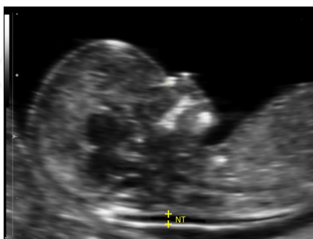
Figure 1. Normal nuchal translucency thickness (NT)

Nuchal translucency (NT) is the assessment of the amount of fluid behind the neck of the fetus, also known as the nuchal fold. An anechoic space is visible and measurable sonographically in all fetuses between the 11th and the 14th week of the pregnancy (Figure 1). Underlying pathophysiological mechanisms for nuchal fluid collection under the skin include cardiac dysfunction, venous congestion in the head and neck, altered composition of the extracellular matrix, failure of lymphatic drainage, fetal anemia or hypoproteinemia and congenital infection [1]. The abnormal accumulation of nuchal fluid decreases after the 14th week.