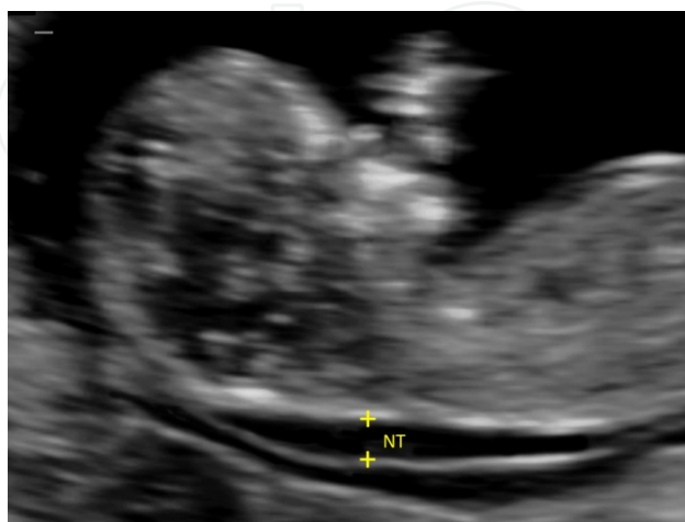
Figure 2. Increased nuchal translucency thickness (NT)

The association between the increased NT and the chromosomal abnormalities has been well documented (Figure 2). It helps us identify the high-risk fetuses for trisomy 21 and other chromosomal abnormalities [2,3].