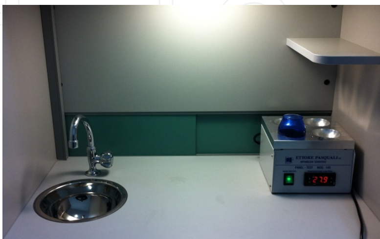
Figure 3. Heating the samples when in the glass

The glass shall contain 14-16 ml of oil, or between 12.8 and 14.6 g if the samples are to be weighed, and shall be covered with a watch-glass. Each glass shall be marked with a code made up of digits or a combination of letters and digits chosen at random.