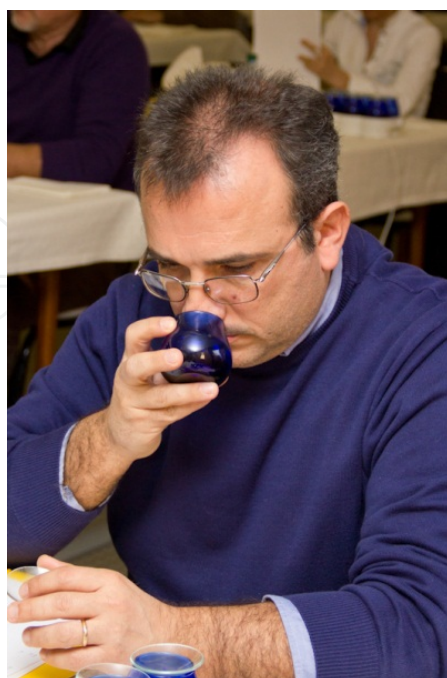
Figure 5. The olfactory test during

Once this stage is completed, he shall remove the watch-glass and smell the sample taking even, slow deep breaths until he has formed a criterion on the oil under assessment. Smelling shall not exceed 30 seconds. If no conclusion has been reached during this time, he shall take a short rest before trying again (Fig. 5).