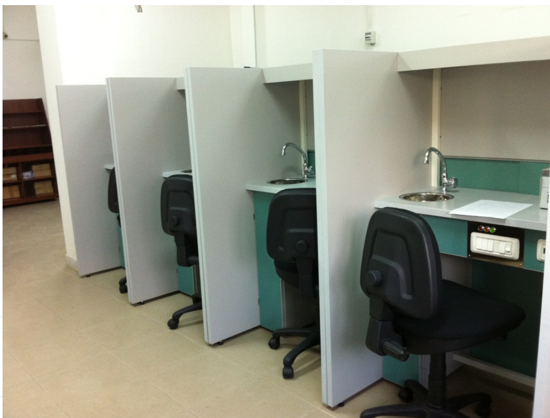
Figure 4. Cabins of the test room

The morning is the best time for tasting oils. It has been proved that there are optimum perception periods with regards to taste and smell during the day. Meals are preceded by a period in which olfactory-gustatory sensitivity increases, whereas afterwards this perception decreases. However, this criterion should not be taken to the extreme where hunger may distract the tasters, thus decreasing their discriminatory capacity; therefore, it is recommended to hold the tasting session between 10:00 in the morning and 12:00 noon (Fig. 4).