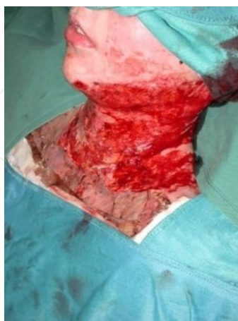
Figure 3. After necrosectomy.