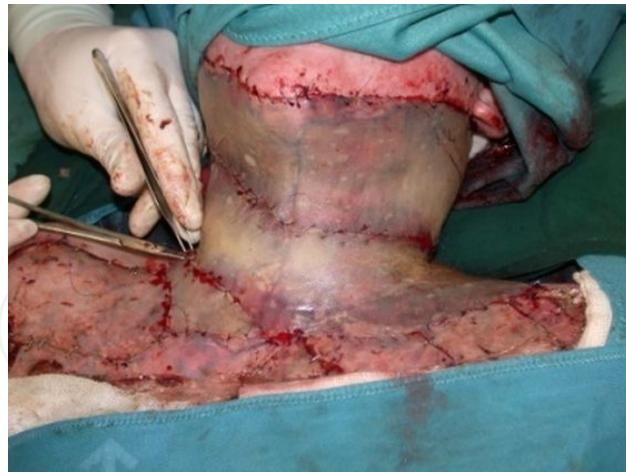
Figure 4. Split-thickness skin graft, unmeshed