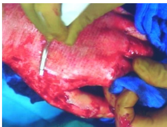
Figure 7. 45-year-old man, grade partial thickness burns on both hands