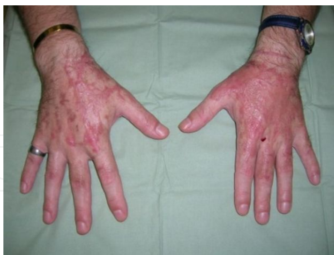
Figure 9. 6 months postoperatively, the left hand is covered with a split-skin graft while the right hand was treated by conservative means