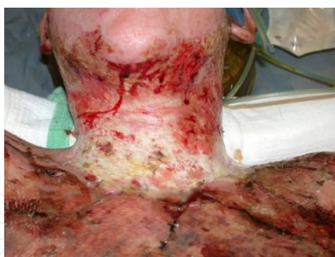
Figure 1. 6-year-old boy, grade partial to full thickness scalds in the chest and neck, 11% of body surface.