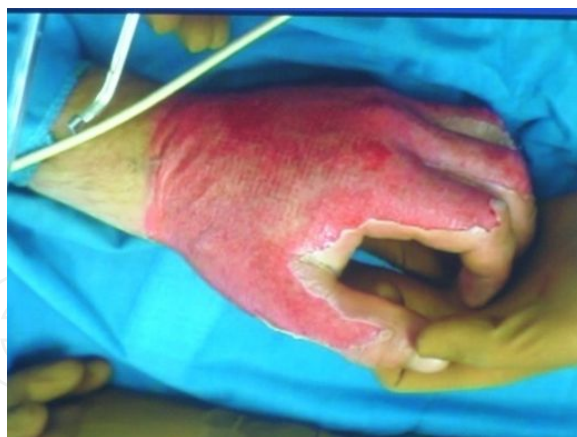
Figure 6. 45-year-old man, grade partial thickness burns on both hands