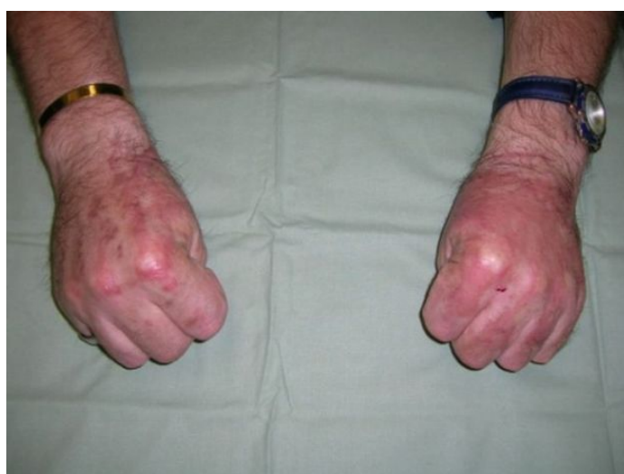
Figure 10. 6 months postoperatively, the left hand is covered with a split-skin graft while the right hand was treated by conservative means