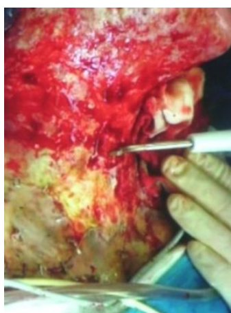
Figure 2. Necrosectomy with Versajet®.