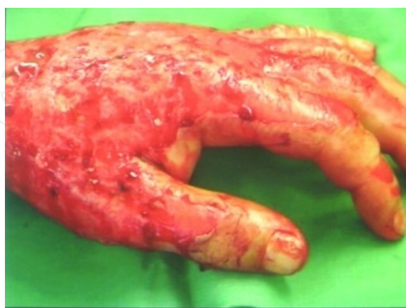
Figure 8. Post debridement