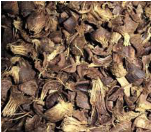
Figure 5. Palm Oil Shell