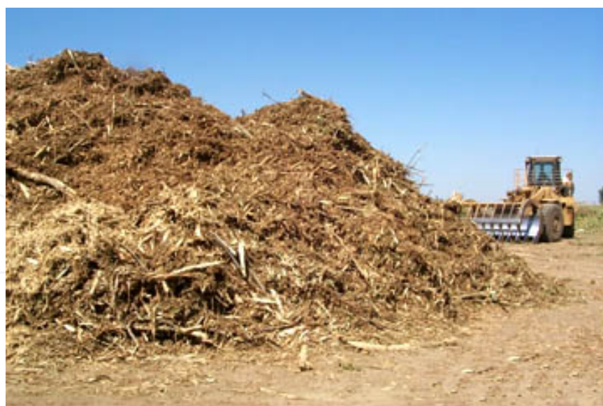
Figure 2. Biomass heaps (bagasse) in rural areas

There is an enormous biomass potential in the country such (Figure 2) as bagasse that can be tapped by improving the utilization of existing resources and by increasing plant productivity. Bioenergy can be modernized through the application of advanced technology to convert raw biomass into modern, easy-to-use energy carriers (such as electricity, liquid or gaseous fuels, or processed solid fuels). Therefore, much more useful energy could be extracted from biomass. The present lack of access to convenient energy sources limits the quality of life of millions of people, particularly in rural areas. Since biomass is a single most important energy resource in these areas its use should be enhanced to provide for increasing energy needs. Growing biomass is a rural, labour-intensive activity, and can, therefore, create jobs in rural areas and help to reduce rural-to-urban migration, whilst, at the same time, providing convenient energy carriers to help promote other rural industries.