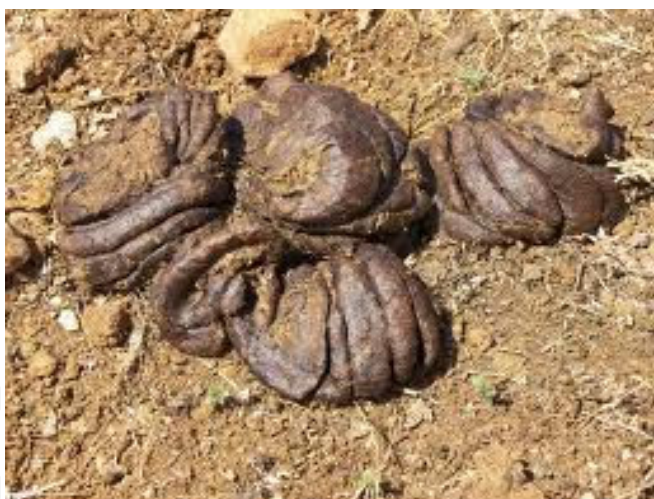
Figure 11. Cow dung

The challenge is how to quantify the energy potential from animal waste in the country. Advanced investigation is needed. Figure 11 shows cow dung, which is used as source of energy in rural areas.