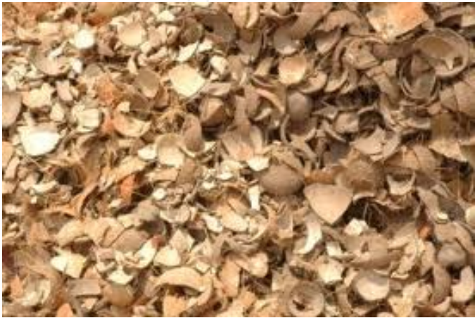
Figure 7. Coconut shells