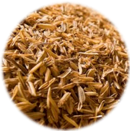
Figure 4. Rice husk (Crop residue)