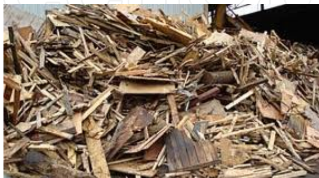
Figure 12. Wood waste in Mwanza Municipality

Such waste consists of lawn and tree trimmings, whole tree trunks, wood pallets and any other construction and demolition wastes made from timber (Figure 12). The rejected woody material can be collected after a construction or demolition project and turned into mulch, compost or used to fuel bioenergy plants