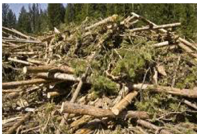
Figure 10. Forest harvesting waste at Sao Hill

There about 80,000 hectares of state owned plantation forest that are mostly linked to state owned wood based panel industry and the pulp and paper industry. It is estimated that there are 25,000 hectares of private owned plantations. In addition, more than 75,000 hectares belongs to villagers, local government, NGOs and civil societies. Hence, the estimate forest residue potential \text{m}^3 per year is about 205,400 tonnes. The residue can be used for modern energy conversion.