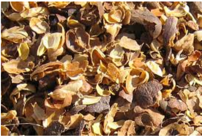
Figure 6. Coffee husk (Source of energy)