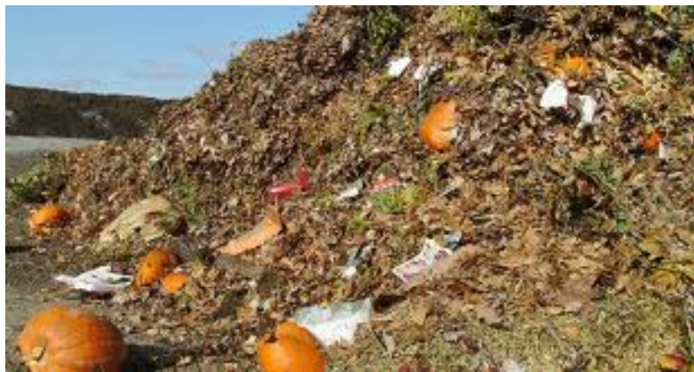
Figure 9. Heaps of Food waste in Urban Tanzania