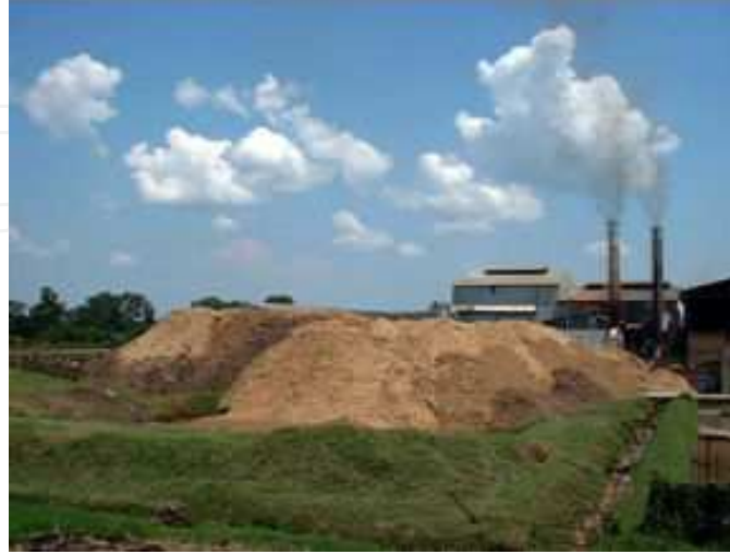
Figure 13. A heap of bagasse at Sugar Factory

Industrial waste such as bagasse (Figure 13) from sugar plants find application in co-generation process, which generates electricity that is used by the same plant. The excess is supplied to the nation grid