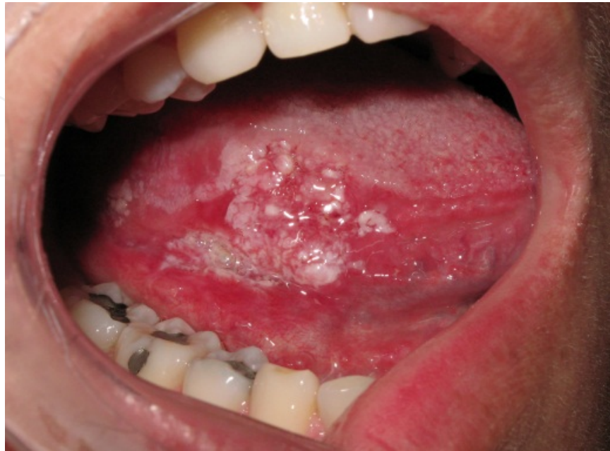
Figure 1. Squamous cell cancer of the posterior lateral border of the tongue in a 28-year-old woman. She smoked a cigarette per day for 15 years.

highest frequency (Figure 3). Since oral squamous cell carcinoma (OSCC) is the main malignant neoplasia we focus in it.