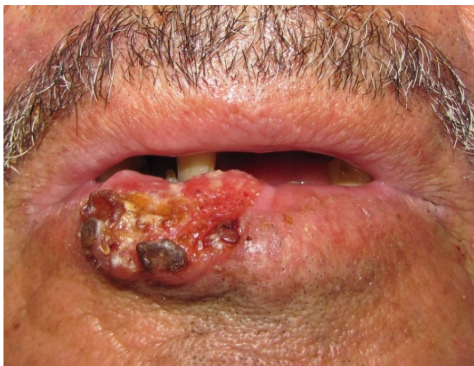
Figure 3. Squamous cell cancer of the lip in a 74-year-old man. He was a farmer and consumed alcohol chronically.

There are premalignant lesions recognized like: leukoplakia, erythroplakia, oralsubmucosal fibrosis, palatal lesions of reverse cigar smoking, oral liken planus, discoid lupus erythematosus, and hereditary disorders like congenital dyskeratosis and epidermolysis bullosa, but beyond of a clinical standpoint, diverse carcinogenic molecular mechanisms have been postulated. The main target is the DNA, since mutations that occur in it generates a wide range of deleterious effects in the cell. In a very general overview, the balance between tumor suppressor genes and those genes that induce cell cycle is altered. Allowing cells to escape cell cycle control and developing an unpredictable biological behavior. Subsequently, the cells express molecules that allow them to acquire an invasive phenotype, a phenomenon known as epithelial-mesenchymal transition. Why malignant cells colonize distant sites? Is not yet fully understood, but it is the feature that makes it lethal.