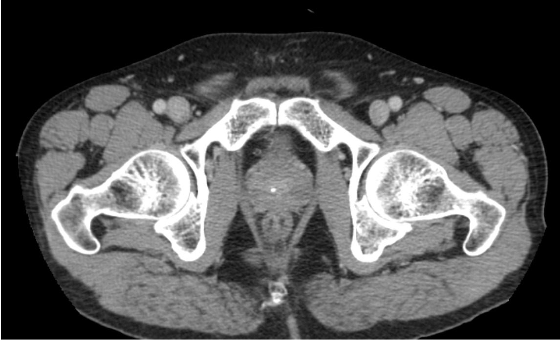
Fig. 3. Pelvic CT scan showing prostate stone in the prostate gland

prostatitis symptom scores were decreased [21]. However, there was no relationship between chronic prostatitis symptom scores and prostatic calculi or level of the histological prostatic inflammation [21].