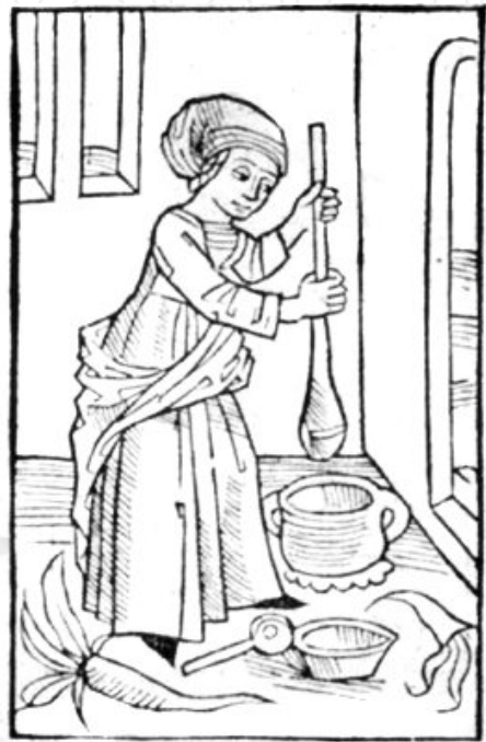
Figure 1. Portray of a woman making butter (Paris, 1499). Source: Compost et Kalendrier des Bergères . Roberts Library, University of Toronto.

Schrezenmeir 2000). It is also worth to mention that hydrolysis of milk proteins releases a wide array of short bioactive peptides which might have many beneficial effects on human health, such as (i) hypotensive, antithrombotic, antioxidative, antimicrobial, and immunomodulatory activities (Fitzgerald and Meisel 2004, Korhonen and Pihlanto 2001), (ii) enhancement of mineral absorption (Meisel 1998), and (iii) antitumoral properties (Matar et al. 2003). Milk protein and fat contents vary from breed to breed due to both environmental and genetic factors ( Figure 2 )