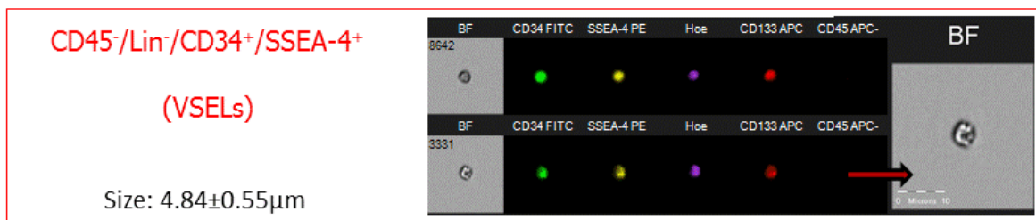
Figure 3. Very small embryonic-like cells extracted from the heart

pattern of pulsatile release of these hormones characterize the prolonged phase of critical illness. Cortisol levels remain elevated in chronic critical illness despite a decrease in ACTH release. The metabolic result of this neuroendocrine array is worsen metabolism of fatty acids and a propensity for fat storing and protein wasting. The immune effects related to neuroendocrine disturbances are impaired lymphocyte and monocyte function and increased lymphocyte apoptosis. It leads to catabolic state and multiple organ dysfunction. Duration of immune suppression correlates strongly with the incidence of related infection. Tissue damage and strong stressors (such as cyanosis, circulatory insufficiency) stimulate regenerative and reparative processes involving stem cells.