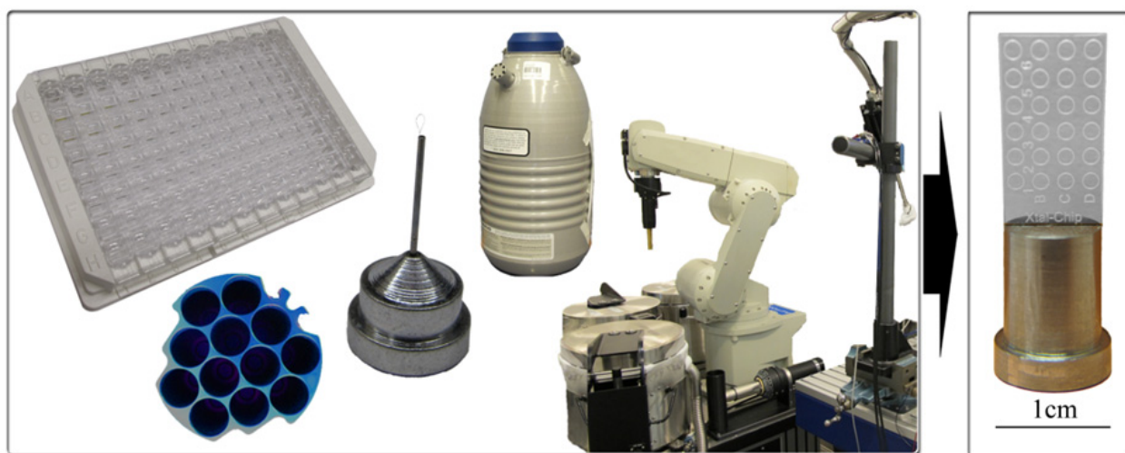
Figure 1. The X-CHIP was designed and developed as a miniaturized and integrated alternative to conventional methods of crystallization and data collection.

The principal idea behind the X-CHIP was to create a platform that presents an alternative to the conventional crystallographic pipeline by consolidating the processes of crystallization condition screening, crystal inspection and data collection onto one device, streamlining the entire process and eliminating crystal handling and arduous cryogenic techniques (Fig. 1).