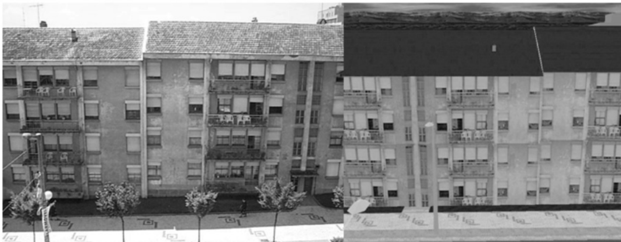
Figure 1. View from the real world (left) and the virtual reality system (right). Adapted from “Contrasting the Effectiveness and Efficiency of Virtual and Real Environments in the Treatment of Acrophobia” by C.M. Coelho, C.F. Silva, J.A. Santos, J. Tichon and G. Wallis, 2008, PsychNology , 6(2), p. 206. Copyright 2008 by PsychNology Journal. Adapted with permission.

However, VR-assisted treatment of acrophobia is not only effective and time efficient, but additionally represents a series of advantages. Anxiety inducing situations such as being on bridges or high buildings can be experienced without any great logistic efforts. Therefore, difficulties of accessing the actual place and potential disturbances by pedestrians can be avoided.