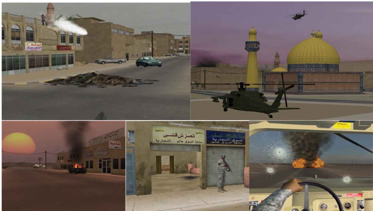
Figure 3. Virtual Iraq/ Afghanistan scenarios. Courtesy of Virtually Better Inc. and University of Southern California, Institute for Creative Technologies.

However, even though treatment of persons suffering PTSD is crucial, study designs using VR seem questionable with regard to ethical concerns. Exposing war veterans or victims of terror attacks to simulated war scenarios is contra-indicated according to current research on trauma therapy. Certain phases of traumatherapy such as stabilization and development of a therapeutic relationship have to precede the processing of the traumatic experience [86]. In the studies presented here, none of these phases were considered so that VR exposure bore the risk of retraumatization. Besides, if the virtual setting does not in detail project the traumatic event, renewed traumatisation is risked. To date, long-term effects of exposing persons with PTSD to virtual environments are mostly unknown, because efficacy studies rarely collect follow-up data. Therefore, even though the use of VR technology seems feasible in the treatment of PTSD, ethical concerns and aspects with regard to therapy indication always need to be considered.