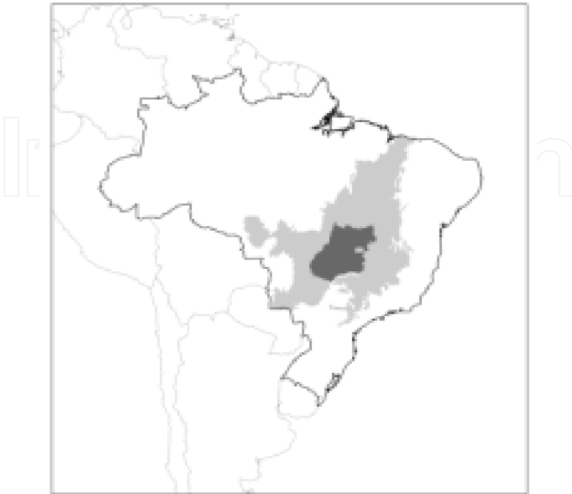
Figure 1. Cerrado area in Brazil, highlighting Goiás state and Federal District (darker area) (Source: [85])

The Latosols are considered the oldest soils on earth. They go from deep to very deep, non hydromorphic, and show great textural variation with clay content ranging from 150 \text{ g kg}^{-1} to more than 800 \text{ g kg}^{-1} [88, 89]; exhibit low natural fertility due to the strong weathering-leaching, which contrasts with their excellent physical conditions favored by the strong and very small granular structure. Latosols also tend to present high acidity (pH 4.0 to 5.5), low cation exchange capacity, high anion adsorption capacity (especially phosphate and heavy metals) and low levels of available P (phosphorus) to plants [27, 46, 77].