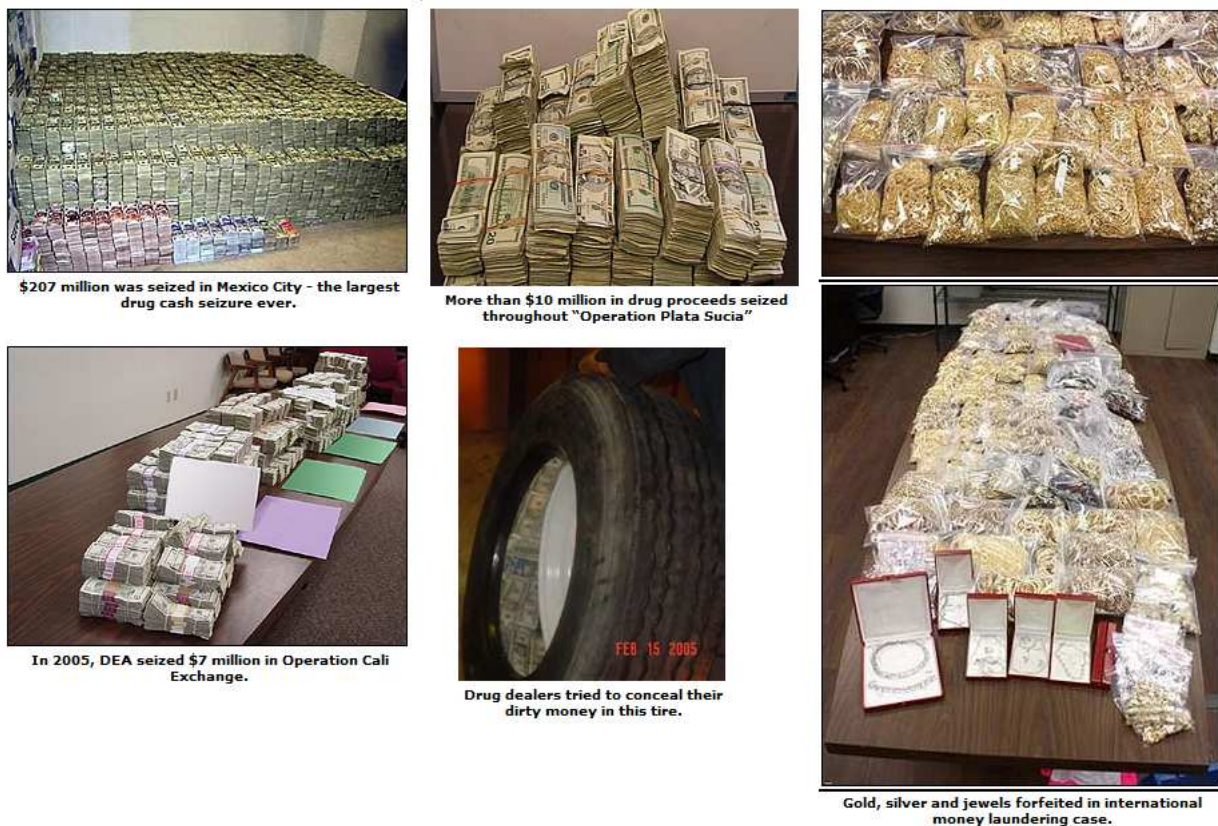
Figure 2. Published crack-downs

Department of Justice and IRS sentenced two men in alleged money laundering scheme: