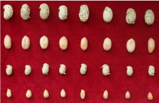
Figure 1. Pods and seeds of mutant type (top 2 rows) and wild type (bottom 2 rows) of A. duranensis

The mutant was identified in a separate square cement block allotted to A. duranensis in the wild peanut nursery at SPRI Experiment Station, Laixi. The plant was grown from a seed of similar size to that of A. duranensis , but was found to possess thicker branches, and larger leaflets, pods and seeds (Figure 1, Table 9). The size and weight of pods and seeds of wild and mutant type A. duranensis significantly differed ( P<0.01 ).