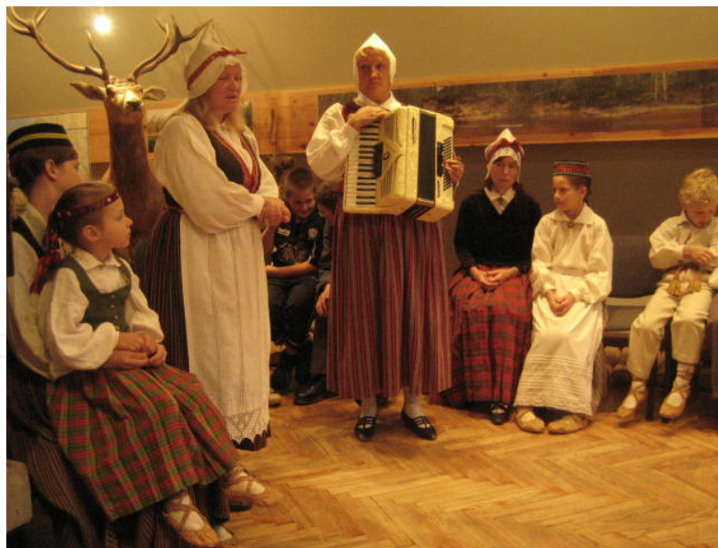
Figure 1. Cultural features and traditions are an important and often neglected asset of protected areas

Acknowledging the role of man within nature and its importance for the conservation of many species, habitats and ecological processes, especially in Europe where cultural landscapes are paramount (Jongman, 2002), multiple use of PAs sometimes becomes a "dogma" for PA planners, managers and policy-makers, irrespective of very different conditions and situations. Most conservation policies try to force sustainable development to happen, often through the zoning of PAs (Naughton-Treves et al. , 2005; UNESCO, 2002) or the placing of tourist infrastructures (Farrell & Marion, 2001), regardless of the fact that some activities may conflict with conservational ends. Such conflicts are frequent in densely populated areas between conservation and recreation activities (Tisdell, 2001).