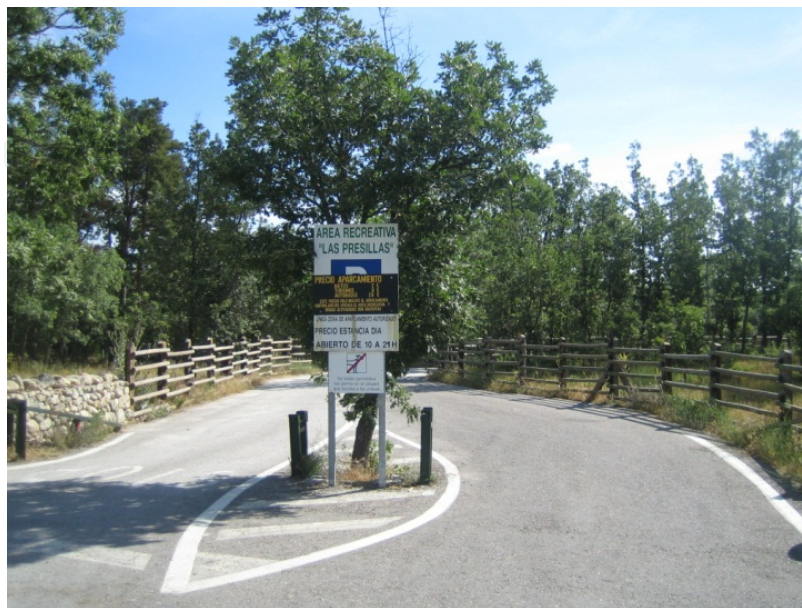
Figure 3. Parking fee in Peñalara Natural Park, Madrid Region, Spain

Well-thought decisions should also be taken about visitors being charged repeatedly during their visits (for instance, for car parking, access to the PA, and / or visitation of public use infrastructure), and about the appropriate quantities to be charged in view of recovery costs, so no additional charges are imposed to the PA administration (Chape et al., 2008).