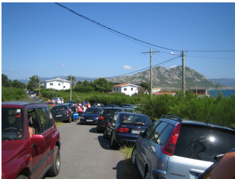
Figure 2. Visitors may be an intense pressure in protected areas

Tourism is an extremely delicate issue regarding PA management. Whereas often seen and promoted as social and economic salvation for local communities, if unregulated it may, on the one hand, lead to the deterioration or destruction of the resources of the PA and, on the other, threaten local culture. If well planned and managed, however, tourism can provide a significant source of revenue for local populations and / or PA administrators, as well as increase visitor education and environmental awareness (Chape et al., 2008).