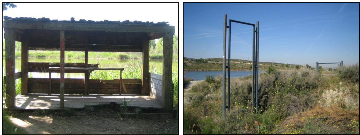
Figure 7. Fauna observation installation in Sureste Regional Park (left figure) and information panels at the entrance of El Regalal-Mar de Ontígola Nature Reserve (right figure). Poor management and inadequate visitor behaviour result in the deterioration of PAs and their infrastructure