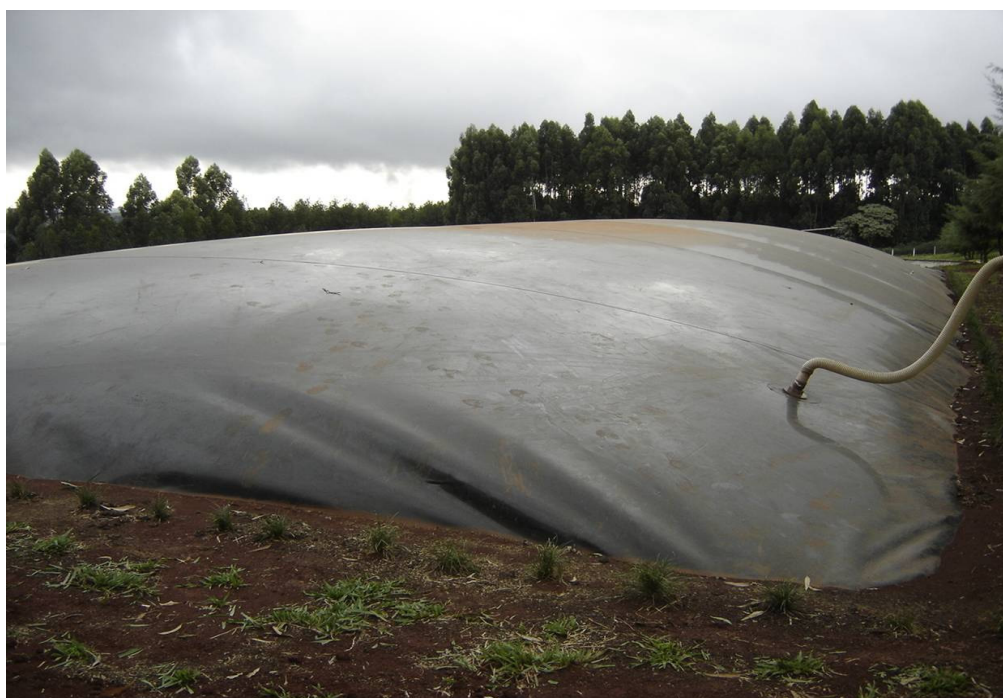
Figure 1. The biodigester set up on the property where research findings were collated.

As Nogueira explains (1986) waste is transformed by agitation which distributes the substrate and bacteria, efficiently using the volume of the biodigester and reducing/eliminating supernatant scum matter. In order to have a guaranteed and precise process, agitators must be inserted into the biodigester in order to correctly agitate the substances necessary for transforming waste. It is also important to maintain the biomass at a heated temperature within the biodigester, for as Nogueira (1986) further points out, the biodigester has to be constructed and set up below ground-level, since this depth serves as a thermal insulator. Temperature plays an important part and it is advisable to ensure internal or external heat (of course depending on the agricultural needs of the producer) because bacteria can reproduce in this way, thereby transforming waste into biogas.