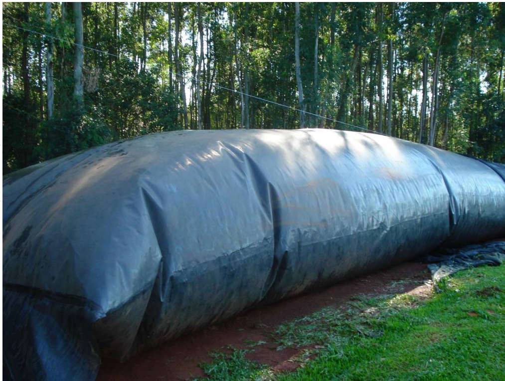
Figure 2. Biogas storage balloon