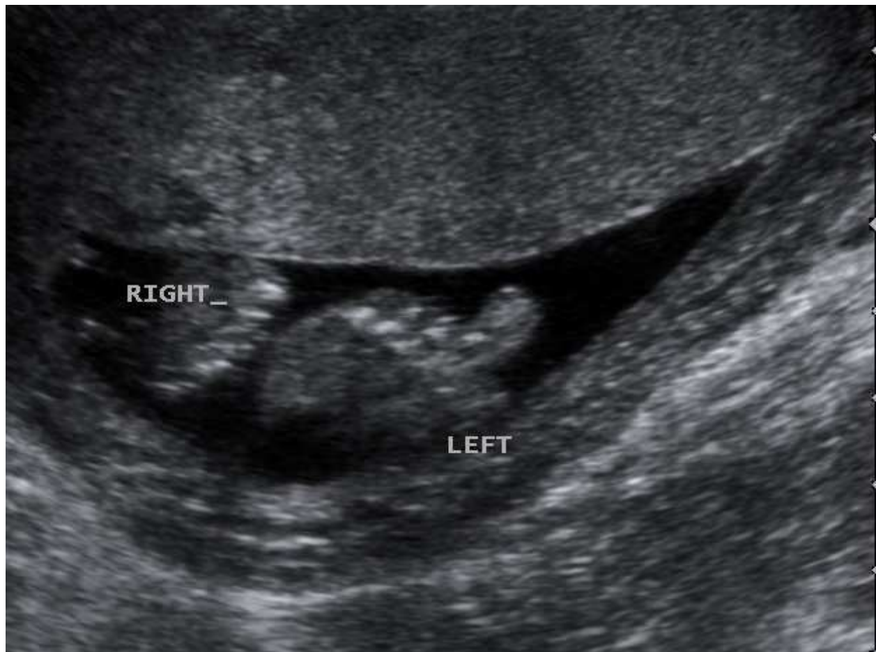
Fig. 1. Ultrasonographic scan of the fetus at 24 gestational weeks demonstrating the difference in size between two second toes. Macrodactyly of the left second toe is confirmed by comparable measurements. This is another image of the same case presented in 'Prenatal diagnosis of isolated macrodactyly' in Ultrasound in Obstetrics and Gynecology 2009; 33: 360-362.