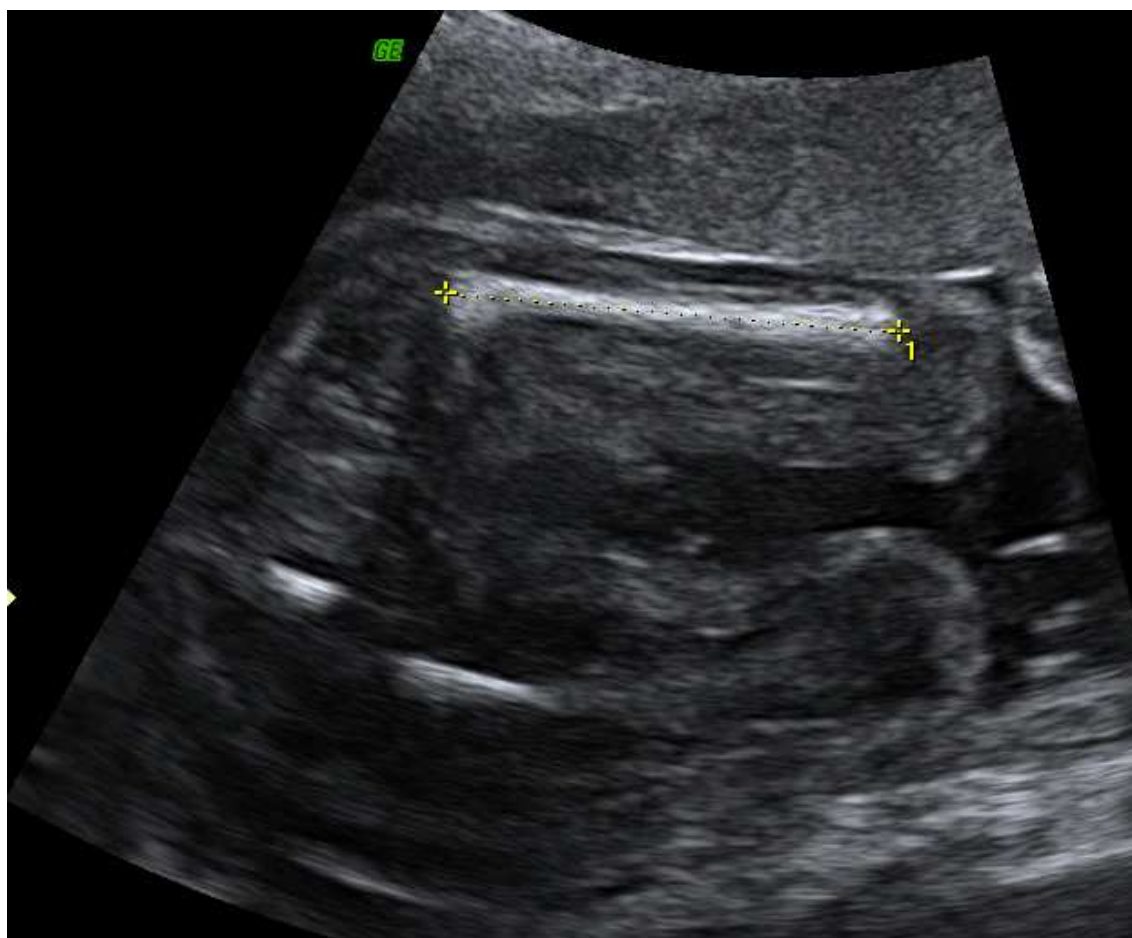
Fig. 1. The scan showing the correct FL measurement

Femur length (FL) is the measurement between the distal and proximal ossification centers of the femoral diaphysis. FL is one of the fetal biometry measurements which is measured ordinarily during the routine second trimester scanning and onwards in determining the gestational age and growth between ultrasound examinations.