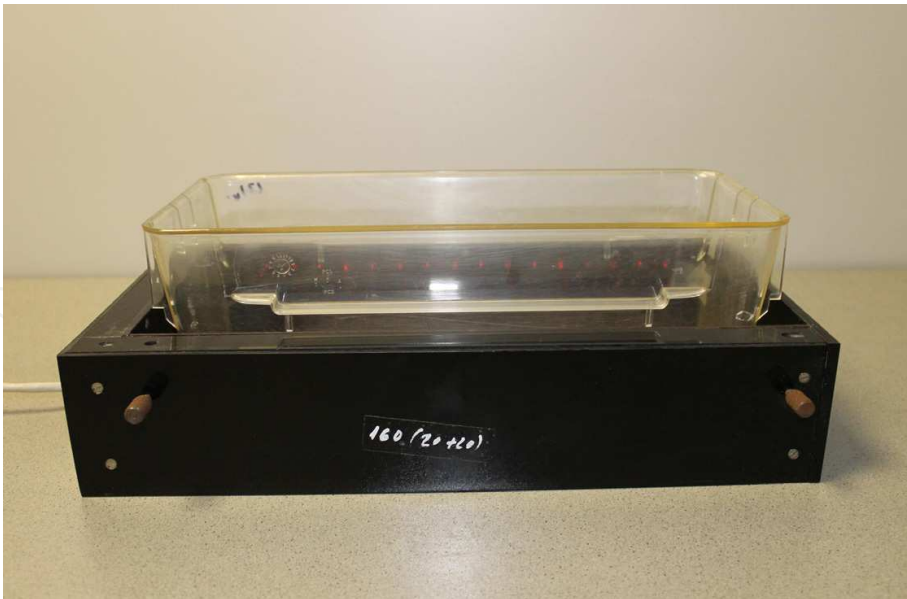
Fig. 2. Complementary tests: Actimeter. This apparatus registers the spontaneous locomotor activity of the animals by means of an infrared photocell system.

The second actimeter (Actisystem II with ‘DAS 16’ software from Panlab S.L., Barcelona, Spain) registered the spontaneous locomotor activity as a function of the variations produced by mouse' movements on the standard frequency (484 kHz) of the electromagnetic field of the sensory unit (35 x 35 cm 2 ). Frequency variations were transformed into voltage changes, which, in turn, were converted into impulses that were collected by a counter when they reached a certain level (see Figure 3). The locomotor activity of the animals was monitored for five minutes.