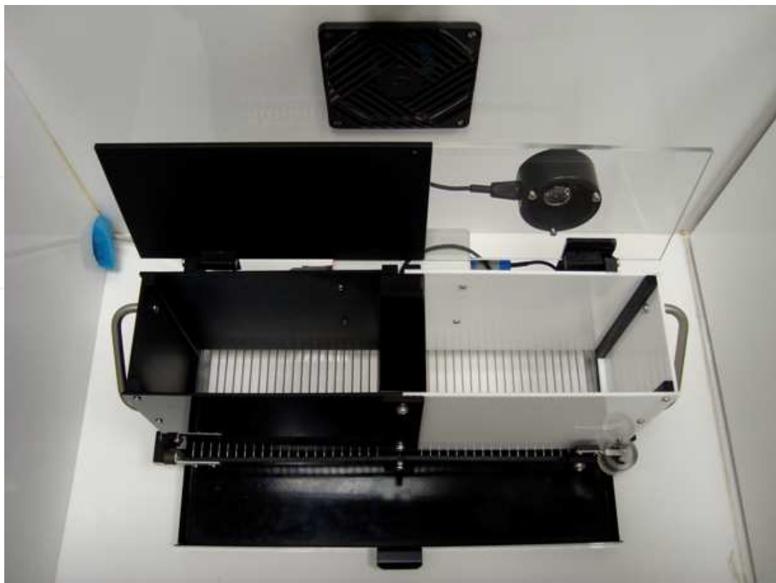
Fig. 1. Inhibitory avoidance apparatus. A step-through version of inhibitory avoidance conditioning for mice, placed inside an isolation box. The two compartments are separated widthwise by a flat-box partition.

Tests were always carried out during the dark phase of the light/dark cycle, after 7-10 days of acclimatization to the animal facility. The training-test interval was 24 hours, or 4, 7 or 21 days (according to the drug administered and the administration schedule). Latencies that were longer in the test than in the training phase were considered IA.