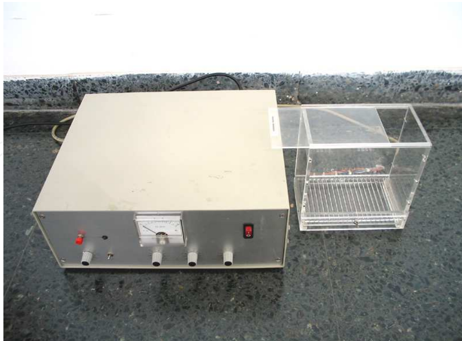
Fig. 5. Complementary tests: Prototype of analgesia. This test measures flinch and jump thresholds.