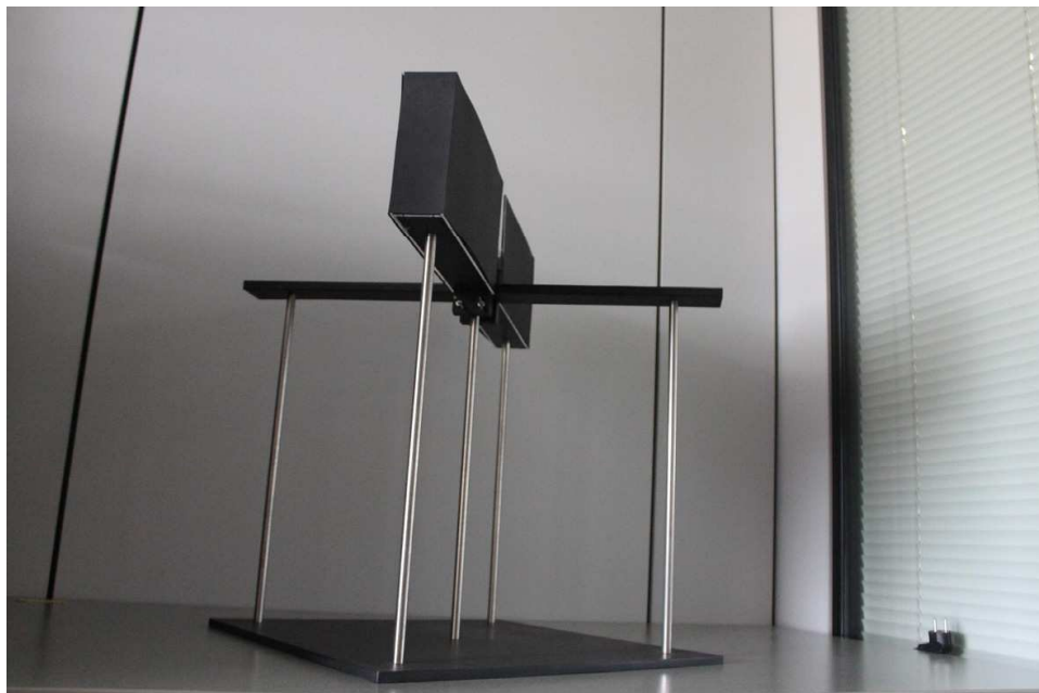
Fig. 4. Complementary tests: Elevated plus-maze for mice. This test measures anxiety and activity.