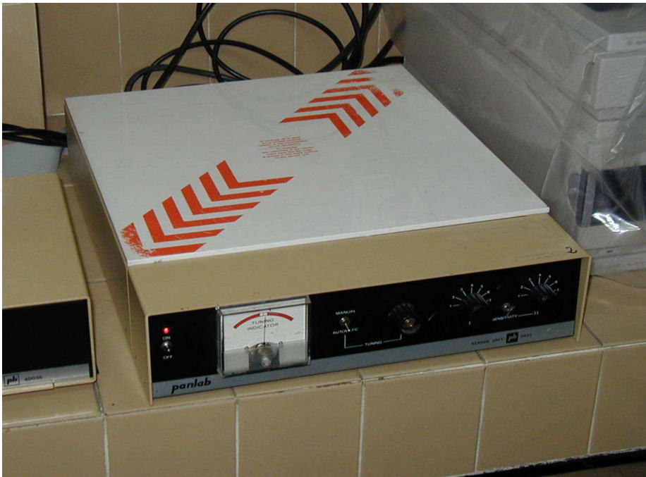
Fig. 3. Complementary tests: Sensor unit of the actimeter. This unit registers the variations of the oscillation frequency in the electromagnetic field produced by the mouse' movements.

The second actimeter (Actisystem II with ‘DAS 16’ software from Panlab S.L., Barcelona, Spain) registered the spontaneous locomotor activity as a function of the variations produced by mouse' movements on the standard frequency (484 kHz) of the electromagnetic field of the sensory unit (35 x 35 cm 2 ). Frequency variations were transformed into voltage changes, which, in turn, were converted into impulses that were collected by a counter when they reached a certain level (see Figure 3). The locomotor activity of the animals was monitored for five minutes.