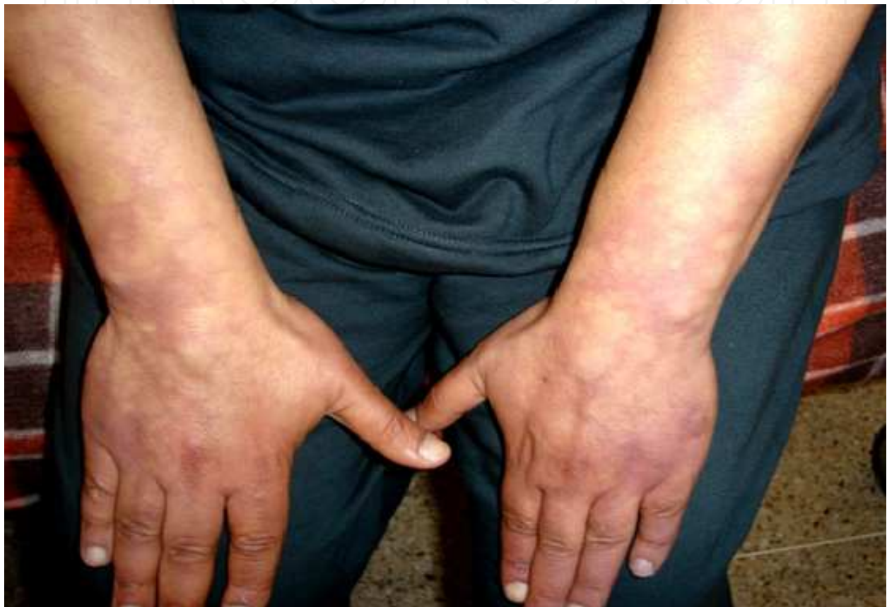
Fig. 1. Livedo racemosa affecting upper limbs in a patient with Sneddon's syndrome (personal figure)

In conclusion, seronegative Sneddon's syndrome should be distinguished from Sneddon's syndrome with aPL which should be considered as a subgroup of APS. Cognitive disorders in both Sneddon's syndrome and APS seem to be similar affecting mainly memory, attention and concentration functions. They represent sometimes the inaugural symptom in a patient without any history of known ischemic stroke. Recurrent stroke may lead to multi-infarct dementia and early retirement in young people. Prognosis depends on early diagnosis. More subtle cognitive dysfunction can be shown. These troubles are related to posterior cortical infarcts or to leucoencephalopathy. Treatment should be aggressive in case of cognitive disturbances in Sneddon's syndrome or APS.