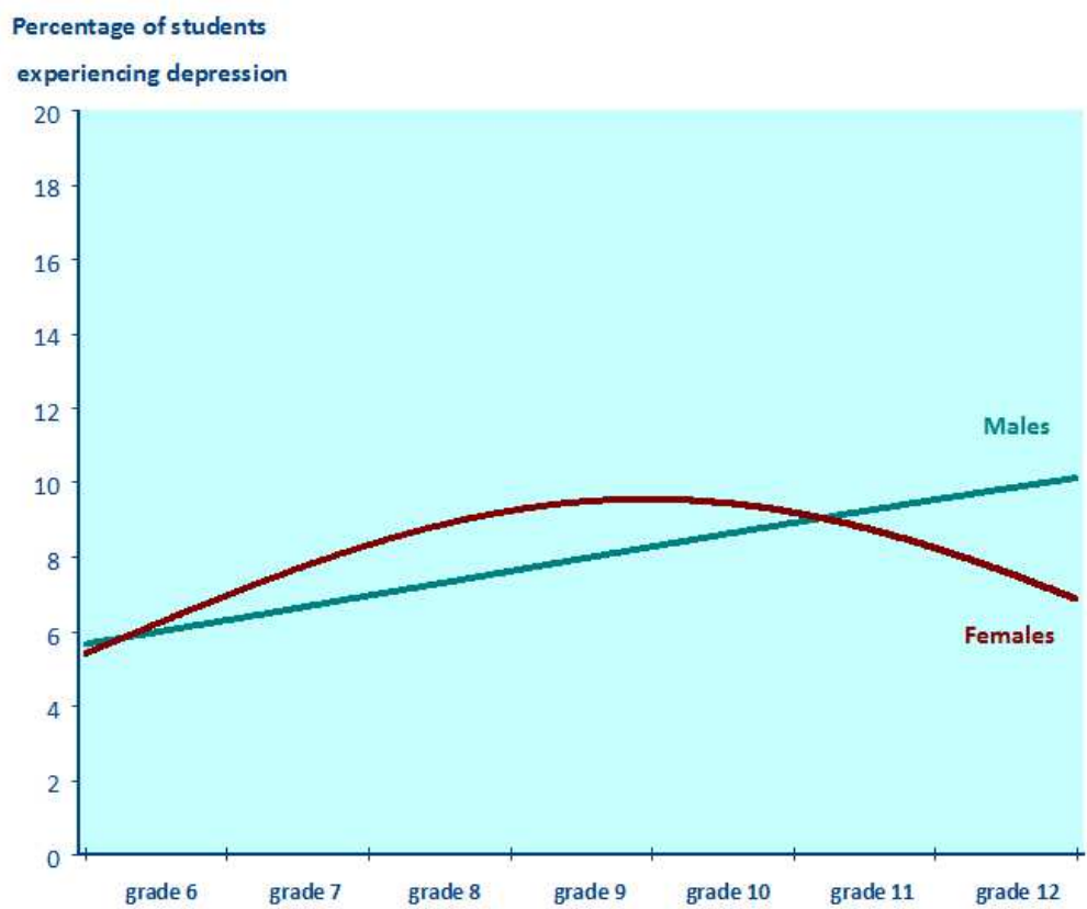
Fig. 3. Prevalence of depression by grade and sex

the middle and high school years, and after grade 10, the prevalence for girls falls through to the end of high school.