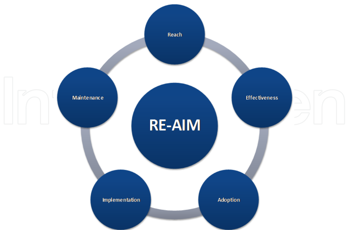
Fig. 1. The RE-AIM Framework

To be effective and meet predetermined expectations, the CDSMP national roll-out necessitated a broad public health perspective. In consultation with translational researchers, AoA administrators drew upon the RE-AIM framework as an organizing framework for program planning and evaluation (Glasgow, et al., 2001; Glasgow, et al., 1999). As part of funding requirements, AoA grantees were expected to describe their use of the RE-AIM model to plan, implement, evaluate, and sustain their proposed health promotion programming.