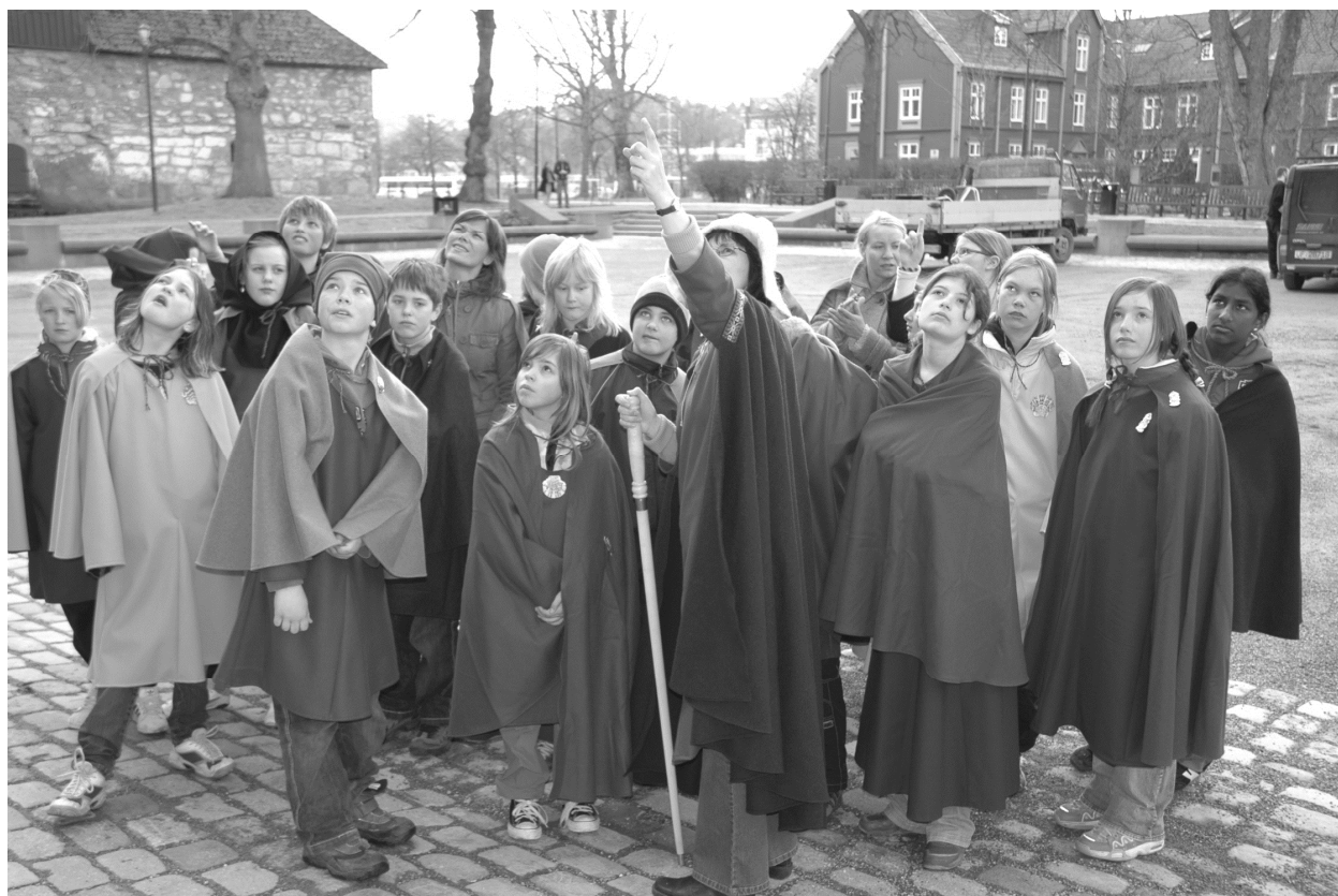
Fig. 4. Maybe characteristics of the third-generation museum, and popularizing of archaeological subjects towards the public and school, is to involve children and students in themselves making dissemination projects under supervising of the museum? Hence in the university museum in Trondheim, Norway, - and exemplified by the design of a collection of middle-age-costume - and then take a "pilgrimage" from the museum to the cathedral and the amazing 1000 - year history behind the building (se also figure 3).

pre-lectures that prepare students for the visit, and post-lectures that further put the exhibits into a broader context. That approximately 80 % of the first-year students at the University of Helsinki had visited Heureka before they had started their studies, may support the impression that informal learning sources can represent a motivational factor, and create active attitudes towards science, research and technology among young people (Salmi 2000). The importance of integrating the object of the visit towards the textbooks on school can also be stressed by that there at least in some museums and dissemination projects is more or less even compulsory for teachers to participate in a workshop at the centre in front of the visit with their students.