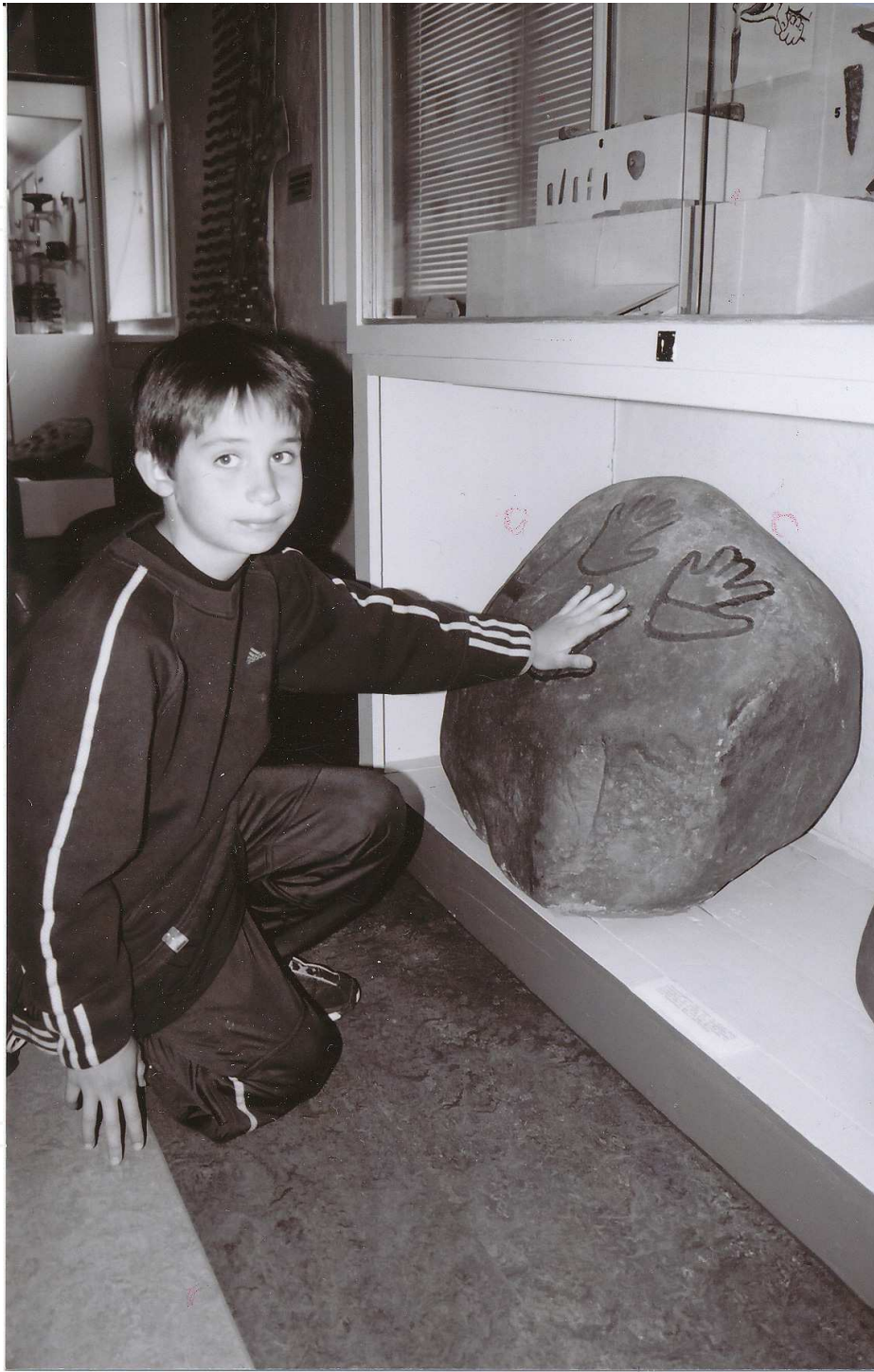
Fig. 2. Second generations museums – hands-on and minds on. Visits behind the exhibitions, and stay for a day with the archaeologist – in the museum and maybe it sometimes also is possible to go with him to the field-work. Get even deeper insight into his way of working. Exhibitions where students do their own experiments are figured out in a number of more classical museums – and are among the essential ideas behind the science centers. (Photo: K Overskaug).