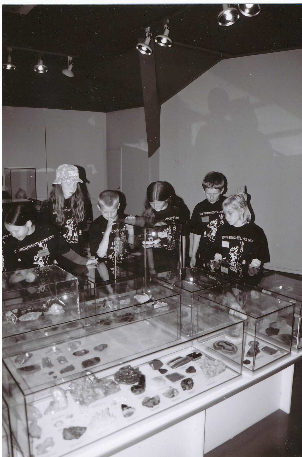
Fig. 1. First generation museums – exhibitions in glass cases. This may still function very well, in particular if there are possible to tell a story behind the exhibition and the artefacts. When were they sampled? Under what conditions – accidentally or as a result of a larger project? What was the background for the project?.