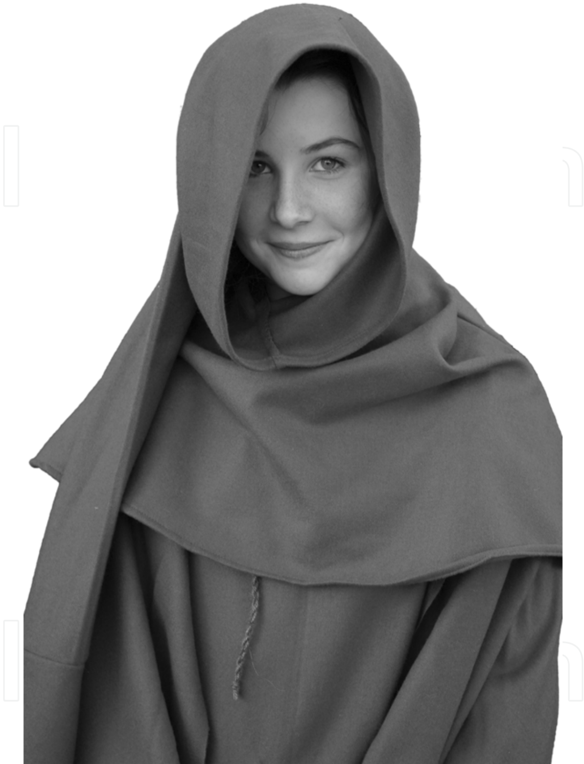
Fig. 3. The tunic of a medieval man from Sweden (see for example Durrani 2006) is among the best-preserved medieval tunics in Europe, and made of wollen fabric. He was wearing a hood with a 90 centimetres (35 in) long and 2 centimetres (0.79 in) wide "tail". On his upper body he wore a shirt and a cloak, while his legs were covered by hosiery. The photo shows a simple copy made on information from the Bocksten Man and other sources, and made by and for students and used for a dissemination project of some of the human life during parts of the medieval time (see Fig. 4).