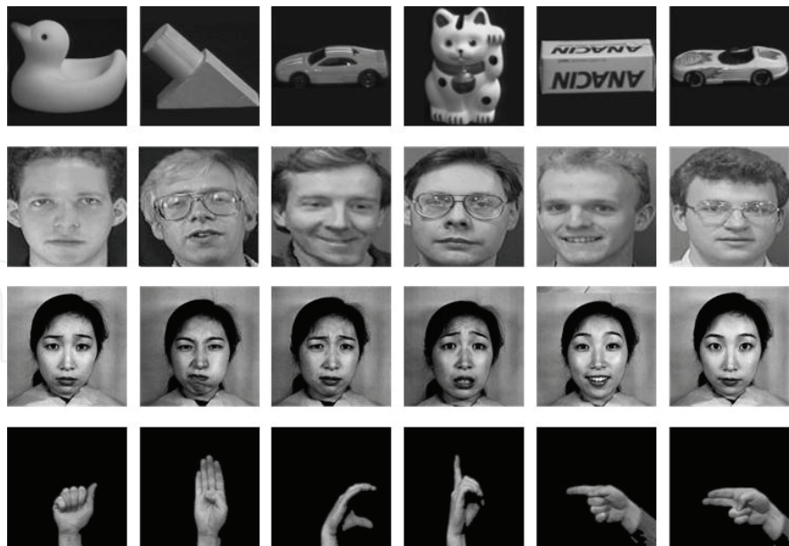
Fig. 2. Six pattern samples of the D1 (1 st row), D2 (2 nd row), D3 (3 rd row) and D4 (4 th row) datasets.

The performance of the wavelet moments (WMs) is compared to this of the well-known Zernike (ZMs), Pseudo-Zernike (PZMs), Fourier-Mellin (FMs), Legendre (LMs), Tchebichef (TMs) and Krawtchouk (KMs) ones. In this way, for each dataset, a set of moments up to a specific order per moment family is computed, by resulting to feature vectors of the same length. It is decided to construct feature vectors of 16 moments length which correspond to different order per moment family (ZMs(6 th ), PZMs(5 th ), FMs(3 rd ), LMs(3 rd ), TMs(3 rd ), KMs(3 rd ), WMs(1 st )). Moreover, the wavelet moments are studied under two different configurations in relation to the used mother wavelet (WMs-1 uses the cubic B-spline and WMs-2 the Mexican hat mother wavelets respectively).