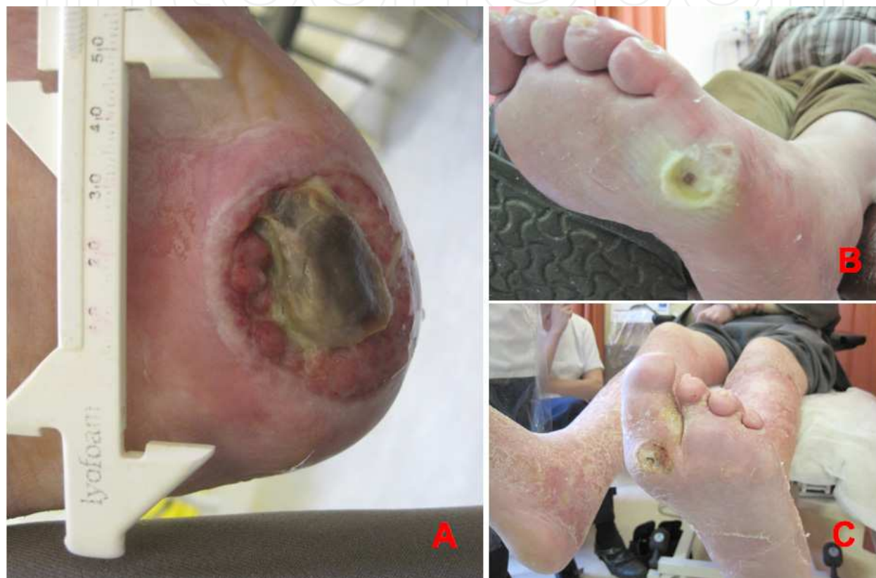
Fig. 1. A. Chronic arterial ulcer on heel, B. Trauma to a diabetic foot, C. Chronic arterial ulcer on patient with previous 2nd toe amputation.

Occasionally patients present with a chronic leg ulcer or wounds that simply refuse to heal as a consequence of poor peripheral blood supply secondary to PAD. Diabetic patients are particularly at risk, due to their increased risk of infection and impaired healing due to known immunological dysfunction and the presence of peripheral neuropathy contributing to foot trauma. Prevention of foot trauma is an essential part of diabetic management and the use of appropriate footwear and access to podiatry services are important elements of the secondary prevention of amputation in diabetics. Trauma to a diabetic foot such as that seen in figure 1B, can lead to a cascade of events resulting ultimately in a below knee amputation.