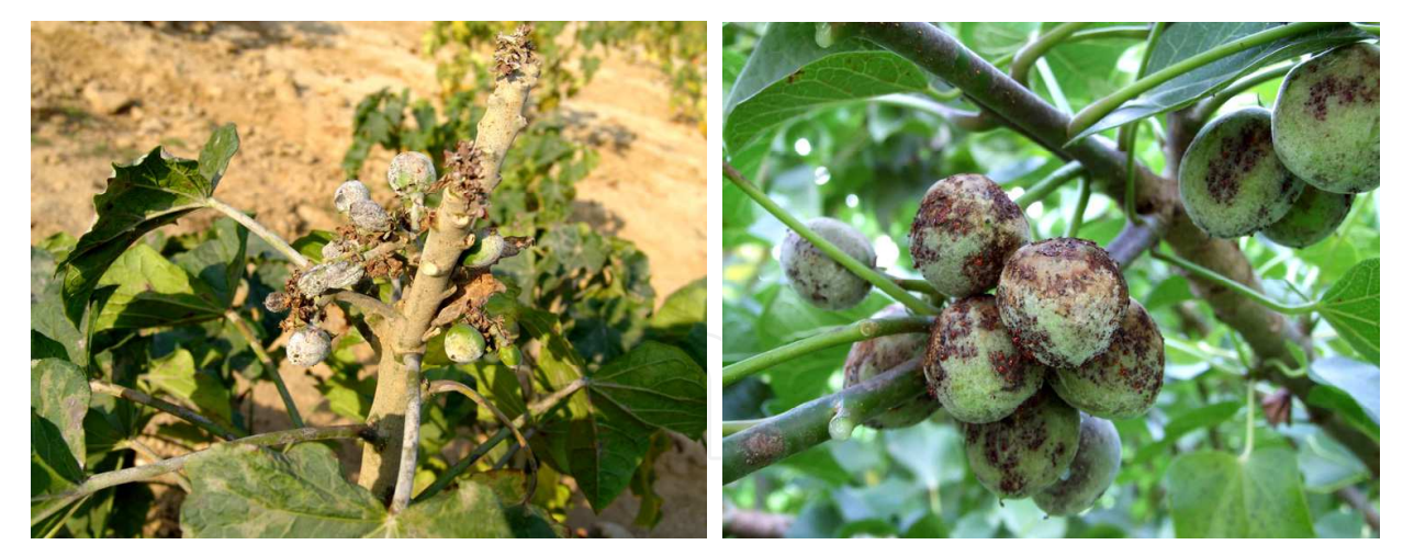
Fig. 3. The main diseases within J. curcas grown in dry-hot valley of Red River