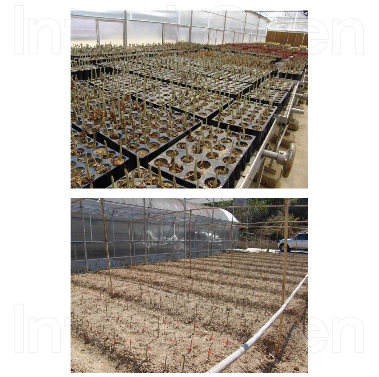
Fig. 1. The good-seed breeding experiments of J.curcas

built by cuttage propagation, so as to select the good new varieties for production application; furthermore, provenance/family determination is carried out to select the good provenance or family, and the good family within the good provenance will go through further asexual reproduction; and then clonal breeding is carried out to appraise and select the good new varieties for building the oil-plant energy forest an enlarged scale and for cultivation and utilization.