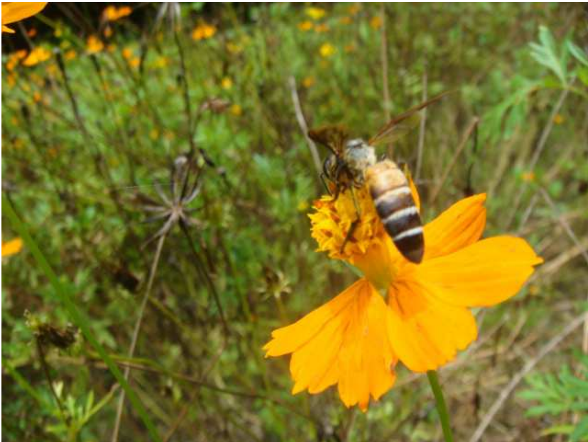
Fig. 2. Pollen source plant of Apis dorsata