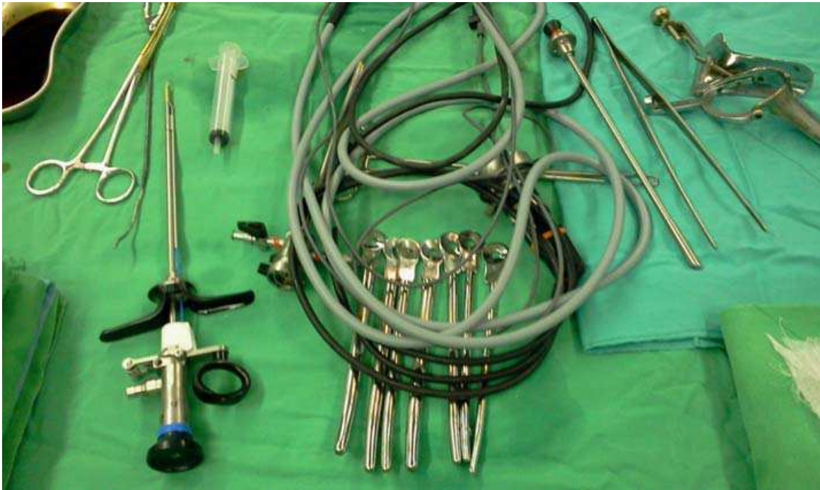
Fig. 1. instrumentation for hysteroscopic endometrial ablation include rigid resectoscope, cables, speculum, and dilators.

developed from the occurrence of Asherman's syndrome that completes destruction of the endometrium will cause amenorrhea.