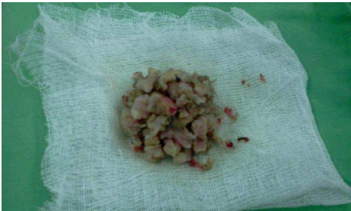
Fig. 3. Collection of myoma chips after resection.

In my series over a 15-year-period, six pregnancies occurred after the procedure, and the mean age of these women was 36 years (range, 34–40 years). Because pregnancies have been reported after endometrial ablation, patients cannot be guaranteed that this is a sterilization procedure, and the risk potential for a subsequent pregnancy must be explained and sterilization or contraception offered. Tubal ligation does not reduce distention media absorption and therefore need not be a prerequisite.