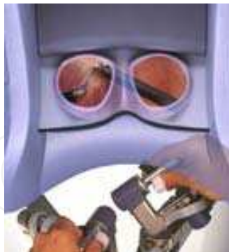
Fig. 3. 3D optics

The camera consists of two high definition units which recreate a true 3D colour image which is viewed by the surgeon at the console. The camera allows for up to 12 x magnification of the operating field, opening up the possibility of performing microsurgical procedures as well as spotting and managing small blood vessels to reduce bleeding and performing nerve sparing surgical dissection (fig 4). Three cameras are available for use on the de Vinci system, one straight and two angled cameras (up and down pointed), which allows the surgeon the options of viewing all nooks and corners of the pelvis and abdomen.