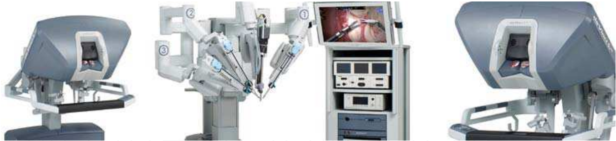
Fig. 4. Products

The third component is the surgical cart which is composed of three to four arms for controlling the 3D camera and two to three surgical instruments. The robotic instruments are “wristed”, thereby providing 7 degrees of freedom ( df ) compared with 4 df with traditional laparoscopy (fig 5). The robotic instruments are controlled by the principal surgeon who sits away from the patient at the surgical console via two “masters”. The movements of the surgeon’s arms and legs are translating in real time to the robotic instruments inside the patient’s abdomen and are processed and scaled to reduce any tremor and thus enhance precision of movements and avoid tissue trauma.