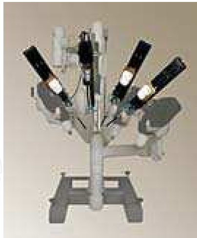
Fig. 1. da Vinci robot