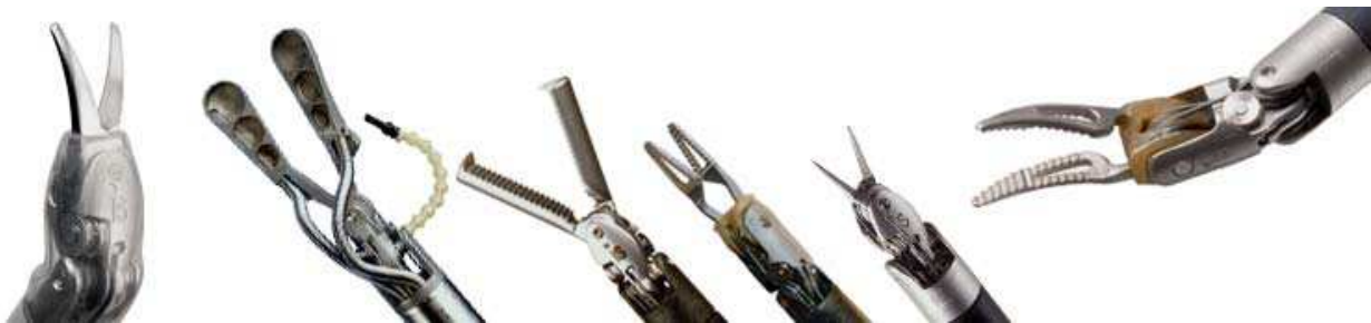
Fig. 5. Instruments

The third component is the surgical cart which is composed of three to four arms for controlling the 3D camera and two to three surgical instruments. The robotic instruments are “wristed”, thereby providing 7 degrees of freedom ( df ) compared with 4 df with traditional laparoscopy (fig 5). The robotic instruments are controlled by the principal surgeon who sits away from the patient at the surgical console via two “masters”. The movements of the surgeon’s arms and legs are translating in real time to the robotic instruments inside the patient’s abdomen and are processed and scaled to reduce any tremor and thus enhance precision of movements and avoid tissue trauma.