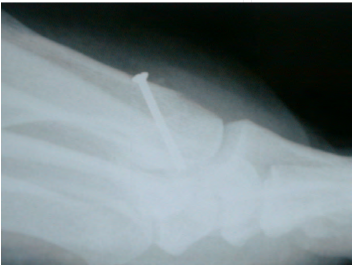
Fig. 4. Lateral radiographic image of the same patient revealing resection of the osteophyte from the dorsal first metatarsal. The increase in joint space can be appreciated in this image as well. Fixation of the osteotomy was provided with a single 3.0 mm short thread cortical screw.