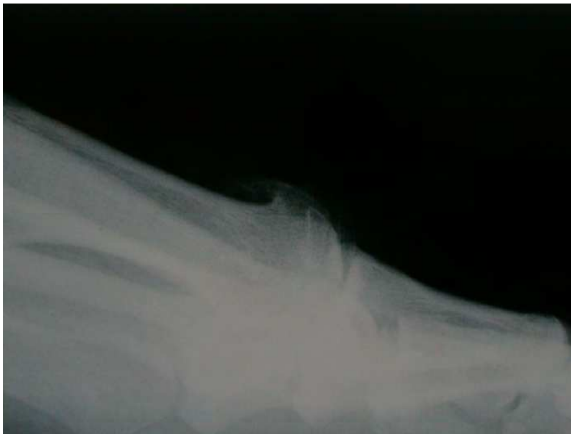
Fig. 2. Pre-operative lateral image of the same patient in Fig 3 with late Stage III Hallux Rigidus. Note the dorsiflexion of the first metatarsal, as well as the large dorsal osteophytic formation to the head of the metatarsal.