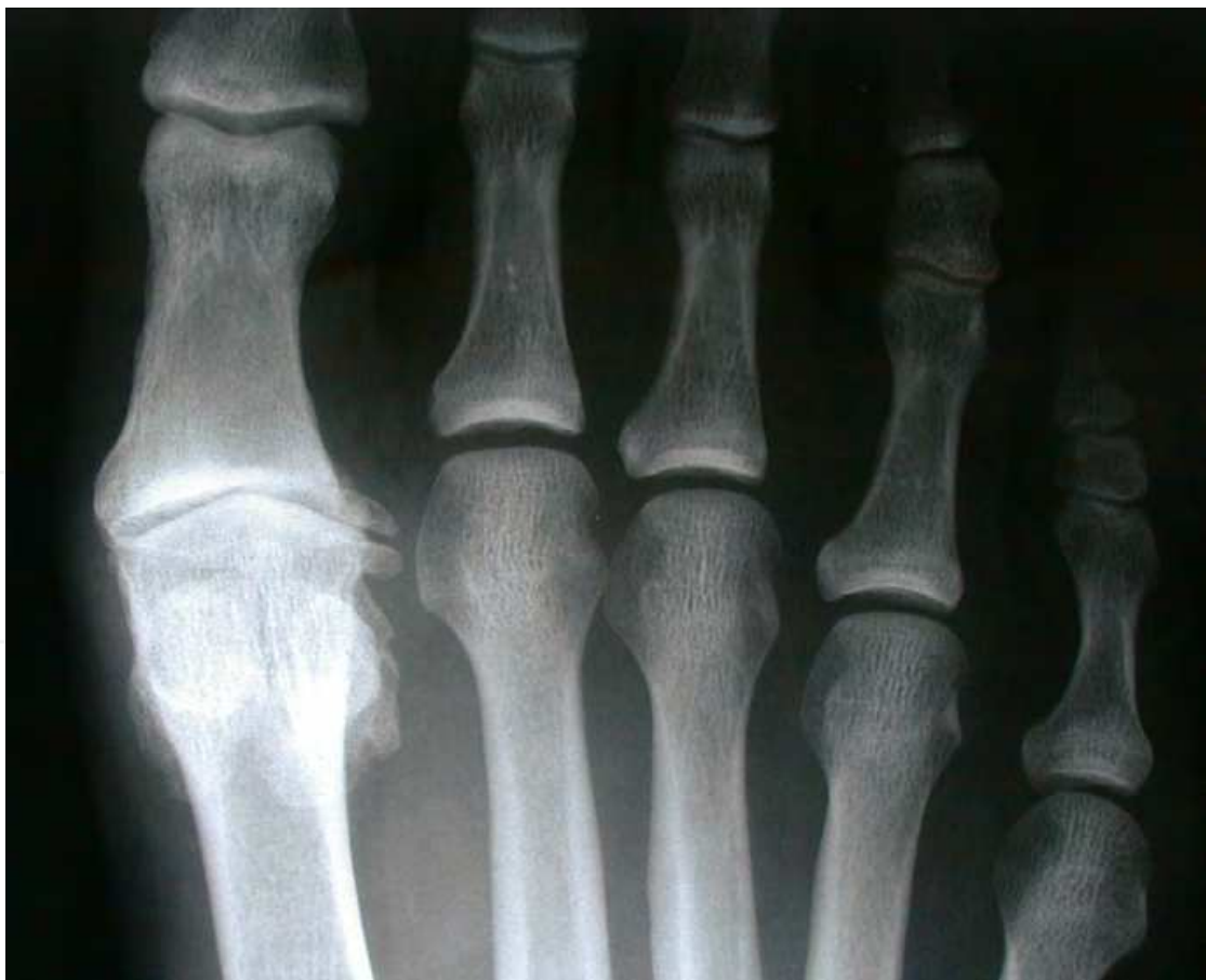
Fig. 1. Late Stage III Hallux Rigidus. Pre-operative AP radiograph with clear evidence of joint narrowing and osteophytic formation.

An isolated decompressional osteotomy of the first metatarsal is allowed to be weight bearing in a postoperative shoe. The DARCO® wedge shoe is preferred for the first three weeks, limiting forefoot loading and possible ground reactive forces that could displace the osteotomy. After week three the patient is then transitioned to a flat stiff soled postoperative shoe for an additional three weeks. Eliminating the propulsive phase of gait with a postoperative shoe is advantageous to the healing of the osteotomy; it does however tend to lead to stiffening of the first metatarsophalangeal joint. To counter the negative affects of a prolonged apropulsive gate, it is critical to start early passive range of motion of the first metatarsophalangeal joint as early as postoperative day three. If chondroplasty of the joint was performed it is absolutely imperative that gentle passive range of motion of the first metatarsophalangeal joint is started early to prevent hemarthrosis, which could also lead to stiffening of the joint (Fig 5).