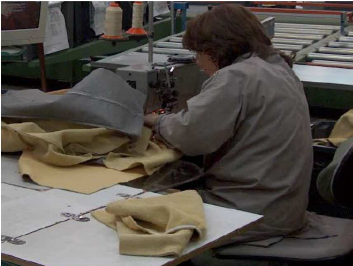
Fig. 3. The seamstress work task showed the highest incidence rates of carpal tunnel syndrome with a gender association.

application of the method achieved a concise and accurate assessment of the risk, even though the tasks analyzed in the upholstered manufacturing industry were not always very repetitive and stereotyped.