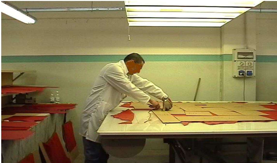
Fig. 1. The productive cycle in the upholstered manufacturing industry: the leather cutter.

The cut material (textile or leather) is then processed by the seamstresses in order to produce the definitive covering: this part of the cycle is made of separated phases that can be carried out from one single operator, or can be carried out in distinguished tasks. In this case the passage from one task to the others is made by the same (usually female) operator. The duration of a seam cycle is extremely variable. The effort of the operators depends on softness and thickness of the covering to be sewed (with one increasing progression from the woven to the microfiber, to soft leather, the thick leather until the crust) and from the complexity of the sofa model.