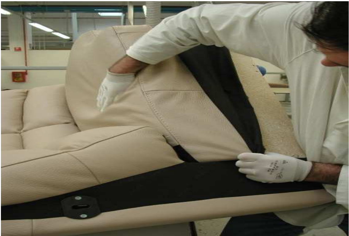
Fig. 2. Upholstery-assembly worker with arm-hand intensive work task.