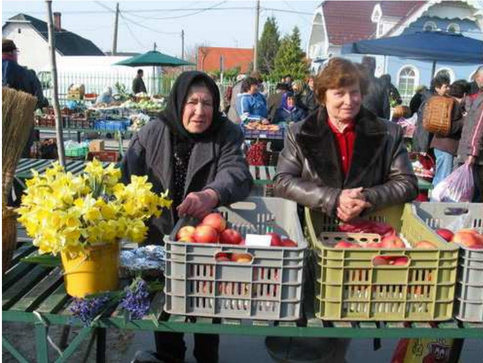
Picture 1. In a traditional village market two generations are selling their own fresh produce and flowers together.

opportunity for farmers to increase their share of the consumer price and to cut some mediators from the distribution chain for these products. In summary, direct sales is a distribution or commercial activity made by local farmers who utilise communication skills that make the purchasing experience of the consumers enjoyable and memorable.