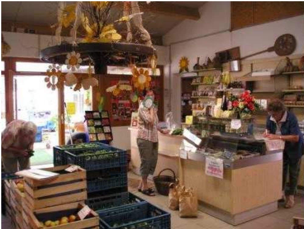
Picture 2. Several farmers cooperatively built a local shop for selling fresh and processed food products.