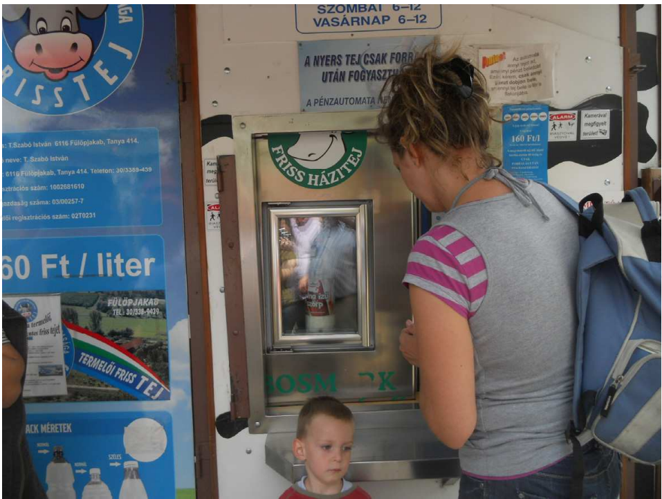
Picture 7. 30-40% price advantages can be reached by using an automatic milk dispenser in the town.

The website represents 95 farmers with 129 products. Most of the farmers joining the programme are leaders in ecological production. Some of the farmers sell fresh vegetables and fruits, others offer prepared products such as marmalade, dried fruits, etc. The program was designed to increase rural tourism, because these activities can serve as complements to one another. On this particular market both products and leisure services are supplied. (Picture: 7.)