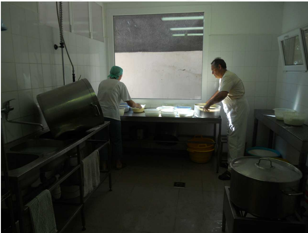
Picture 9. A goat cheese processing unit on a farm is strictly regulated and must maintain hygienic conditions in accordance with high standards.

Despite the fact that agricultural producers do not have the appropriate facilities for retail or processing of foodstuffs, they are obliged to respect the basic rules related to food-sale. (Picture:9.) For instance, if the producer sells the basic product (poultry, rabbit meat) to a local retailer or catering facility, the producer should give the certified copy of the official veterinary document to his business counterpart. In the case of packed goods, the so-called small producer ID, or in the case of honey, the producer ID should be indicated.