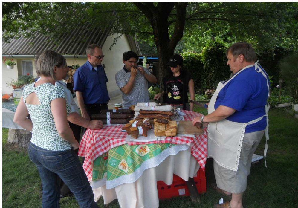
Picture 10. 4-5 farmers work together at a common market on a farm, where once a week they sell their products to regular buyers and tourist as well. The number of buyers can reach 80-100 persons.

In any rural development programme there will be a clear need to coordinate the upgrading of rural markets at farm level with that of associated infrastructure and services if the maximum benefits to agricultural production are to be obtained. This may include upgrading extension services and the improvement of feeder and access roads as well. It should also be noted that directly serving direct marketing at farm's levels may also be critical links in the transport system.