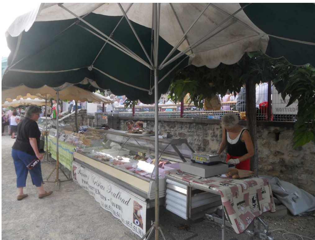
Picture 8. In a French village market tourists are the main clients during the Summer season. The the local government supports the functioning of the market.

It is also important to mention the new direct-from-farm on-line food sale networks, that are already running in many EU countries. This is part of the popular rural tourism, where the customer can get to know the conditions of food production, and meet the producer in person. (Picture: 8.)