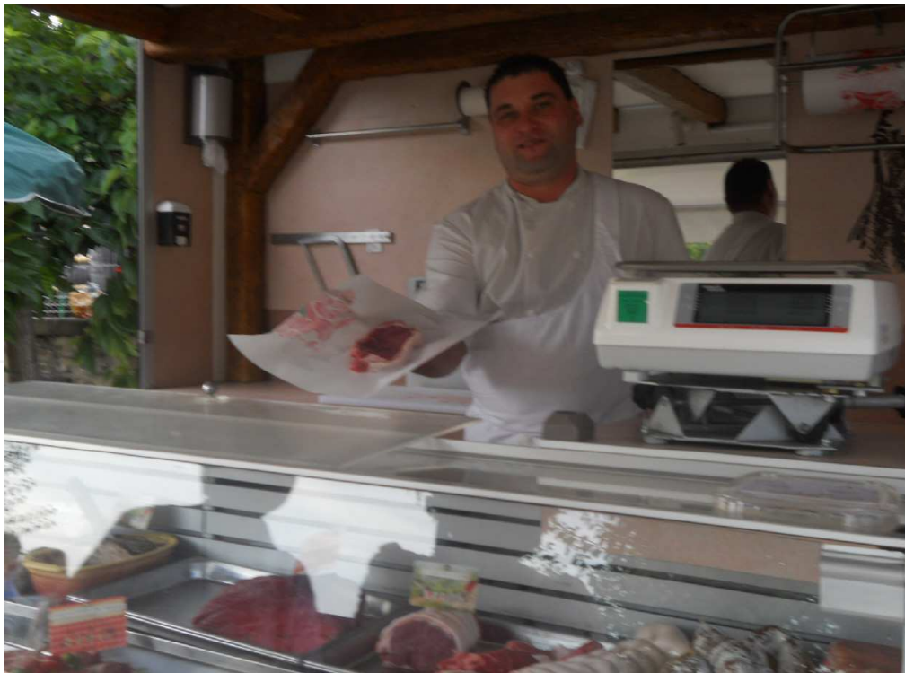
Picture 11. Meat products must be refrigerated and kept in accordance with the hygienic standards. Mobile butcher trucks or trailers are one solution.