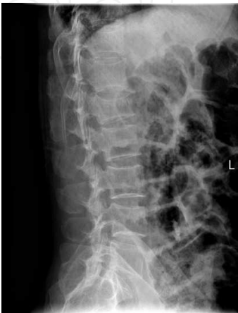
Fig. 8. Lateral X-ray before PKP.