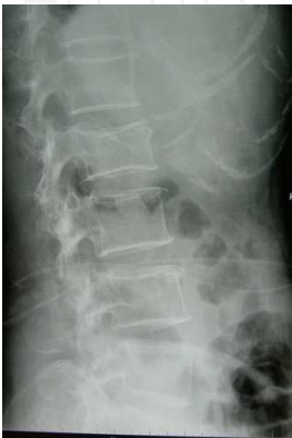
Fig. 2. Lateral X-ray before operation.