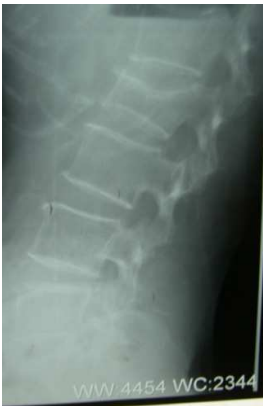
Fig. 1. Lateral X-ray at admission.

In this group of patients, the volume of bone cement injected in each vertebral was 3 ~ 6.5ml. When intraosseous vertebral venography were performed before the injection of bone cement, paravertebral vascular developed an image in 5 cases, then filled the gelatin sponge; peripheral cement leakage was found in 4 cases, intervertebral disc leakage was found in 2 cases and posterior margin leakage was seen in 2 cases (posterior longitudinal ligament is not exceeded), no clinical symptoms appeared. No nerve root or spinal cord injury,no pulmonary embolism or other complications were recorded. All patients had no further vertebral fractures. At admission,preoperative and postoperative X-ray films were shown in Figure 1-7. Figure 2 showed that bolster for self-replacement restored vertebral body height, corrected the kyphosis angle. Figure 5-7 showed that the PVP surgery could maintain and enhance the effect.The stata was showed in Table 1. Bolster for self-replacement combined with percutaneous vertebroplasty significantly improved VAS scores, analgesic use score and activity score, The results were shown in Table 2.