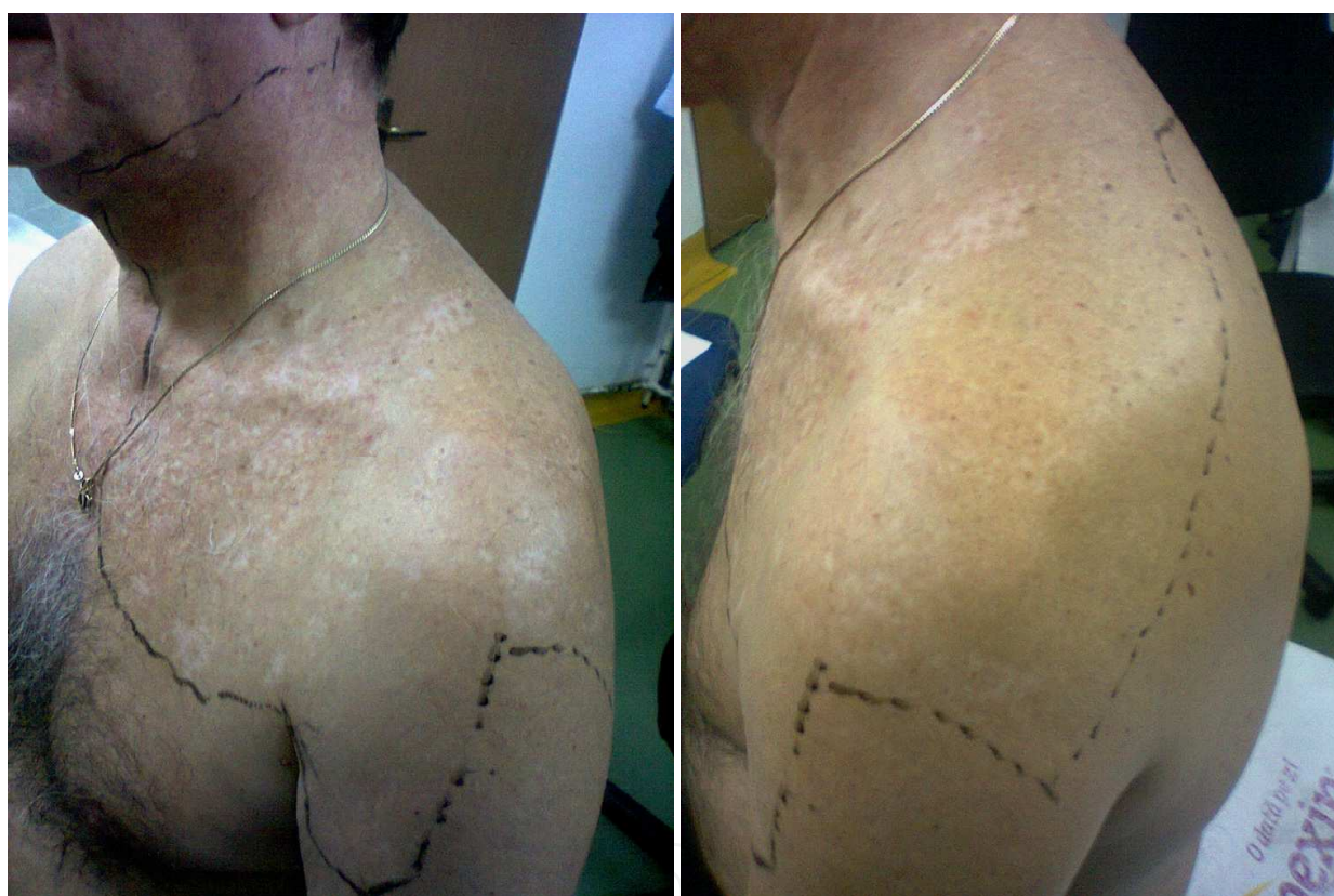
Fig. 1. a)

suggests central sensitization process on spinal level by pre- and post-synaptic changes on second-order neuron induced by ongoing C input: temporal summation, mechanical dynamic and static allodynia. Analyzing the patient's pain in this manner, it is easier to choose the potential optimal pharmacological agents. For this patient a selective sodium channel blocker, like carbamazepine or tricyclic antidepressive and \mu -receptors agonists, opioids, are not suitable because of myasthenia gravis. A calcium-channel blocker \alpha_2 - \delta ligand was recommended with a rating of 8 (VAS) for the mean pain intensity per month. Further local application of capsaicin patch (8%) lowered the pain up to a rating of 5, which the patient considered acceptable in the long run.