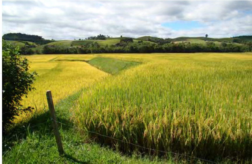
Fig. 3. Overview of a rice crop field on High Itajaí Valley.

trials) for three years through the three major rice areas of Santa Catarina. The management of this rice fields follows Epagri's recommendations. In these experiments, each variety is broadcast sowed in 4 x 15m plots.