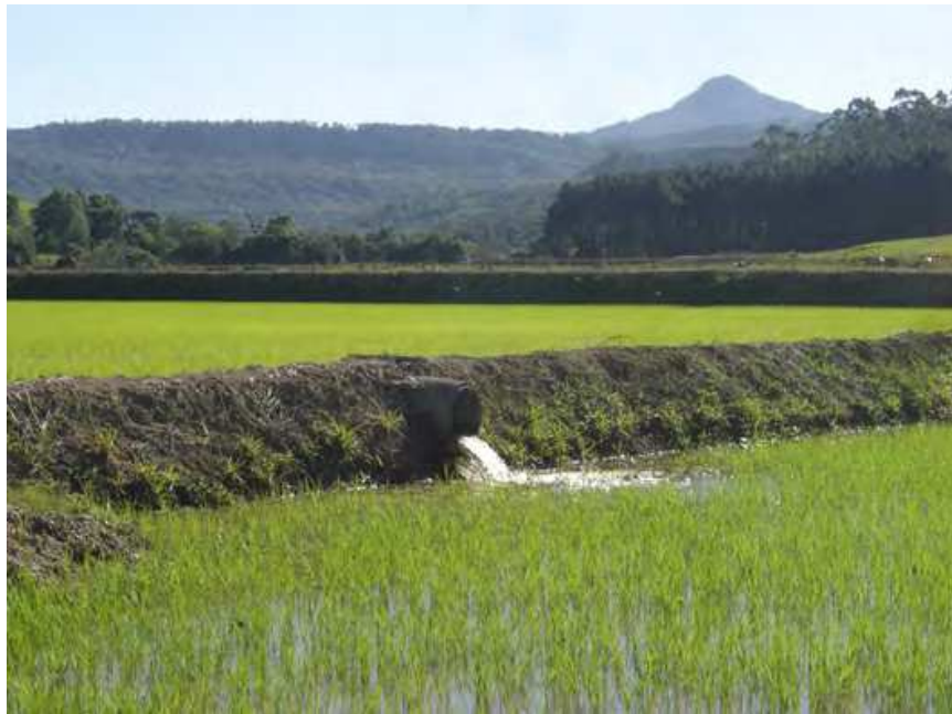
Fig. 2. Aspect of rice culture in Santa Catarina State, with rice growing in water-seeded system.

The general goals of Epagri's Rice Breeding Program are developing improved genotypes of long grains, to improve blast resistance and grain quality. Recently, the program is directed to promote genetic variability and also to develop technologies that have lower environmental impact.