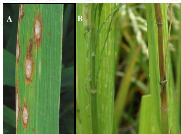
Fig. 1. Rice blast symptoms on leaves (A) and on panicle neck node (B).

The rice plants presents its highest vulnerability period when young plants hold 3 to 4 leaves and during flowering. Blast disease is also favored by temperatures among 20 to 30 °C and relative humidity over 90%, with production of conidia on lesions beginning when humidity surpasses 93%. Frequent occurrence of dew, mist and drizzle are suggestive of ideal conditions to the pathogen. Disease severity is also affected by soil fertility. High levels of organic matter or excessive use of nitrogen can lead to the disease increase when the cultivar resistance is not specific. However, nitrogen deficiency can predispose plants to disease (Prabhu et al., 1996).