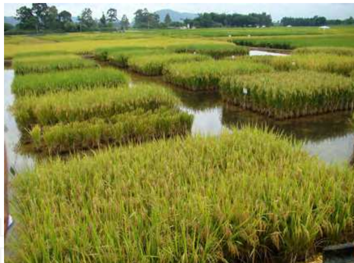
Fig. 4. Overview of Epagri's Rice Breeding Program experimental field.

It is unavoidable to conclude that Epagri's Rice Breeding Program is successful and has contributed, recommending varieties from abroad and, developing new varieties, to increase rice yield in Santa Catarina (only paddy rice considered). The highly quality and yielding varieties released by the Breeding Program of Epagri contributed for the State to hold the highest rice yield in Brazil.