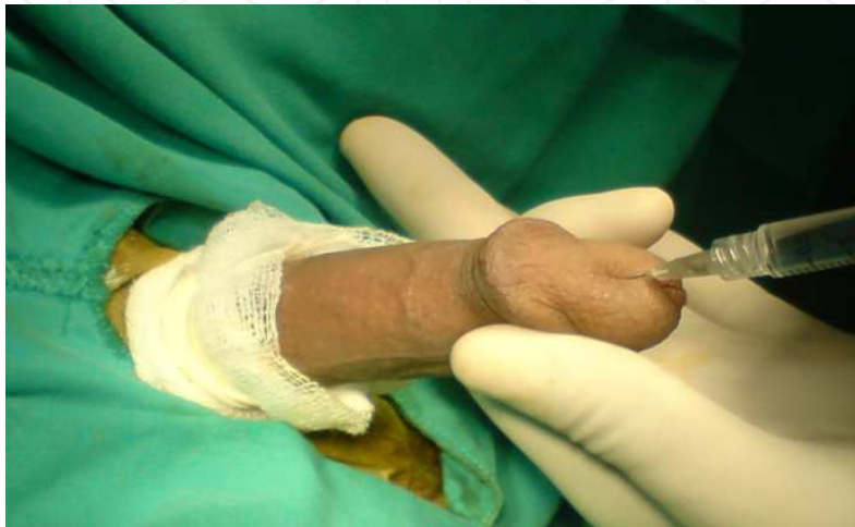
Fig. 2. Spongiosum block being administered using 1% lidocaine without epinephrine in the corpus spongiosum

Another method of local anesthesia, the transperineal urethrosphincteric block using 1% lidocaine showed favorable results in treating anterior urethral strictures, with 92% patients very satisfied with the procedure. No post-operative complications were noted and there was absolutely no need of additional analgesia during the procedure (Al-Hunayan et al., 2008).