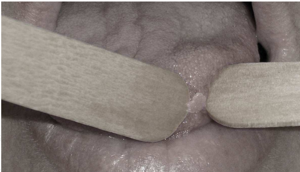
Fig. 1. Verrucose lesion on the left side of the tongue.

The patient reported being HIV-infected for 10 years and no antiretroviral therapy. Blood evaluation showed a CD4 T lymphocyte count of 640 cells/mm 3 and viral load of 585 copies/ml. Oral examination revealed a red verrucous 3 mm diameter lesion, on the left side of the tongue, suggestive of oral SP (figure 1). An excisional biopsy was carried out, and postoperative advise given.