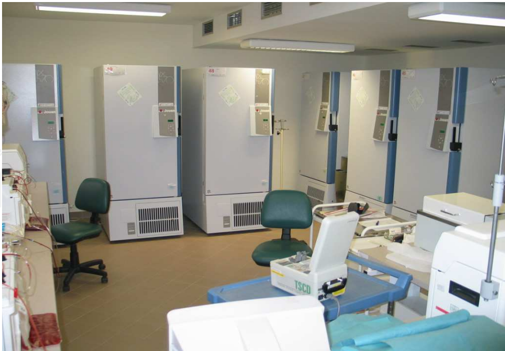
Fig. 3. Mechanical freezers for deep freezing (-65°C - -80°C)