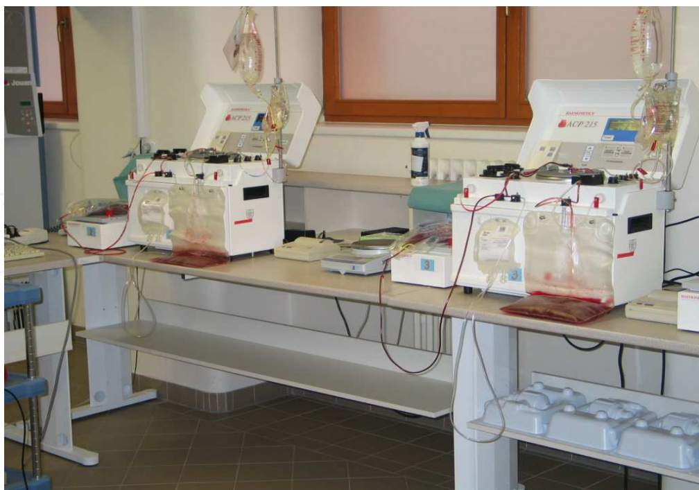
Fig. 2. Haemonetics APC-215, fully automated deglycerolisation (washing) machines with „close system“