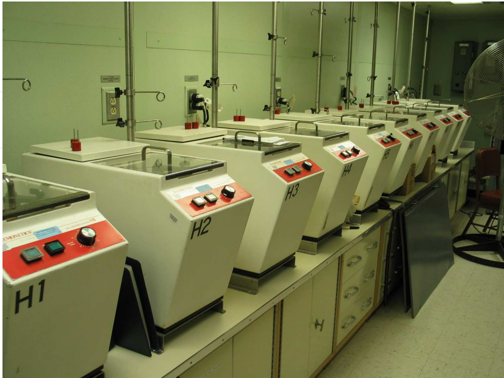
Fig. 1. The line of deglycerolization (washing) machines Haemonetics ACP-115 – first fully automated machines

AS-3 solution (Nutricel) [4,24,25]. Subsequently, Bohonek et al. proved the applicability of cryopreserved erythrocytes 3 weeks after reconstitution, also when using AS-3 [1].