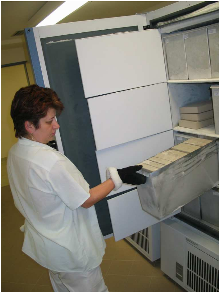
Fig. 4. Stock of frozen blood.