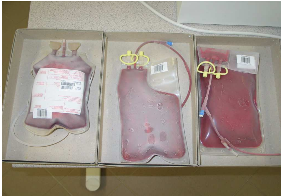
Fig. 5. Frozen RBCs units