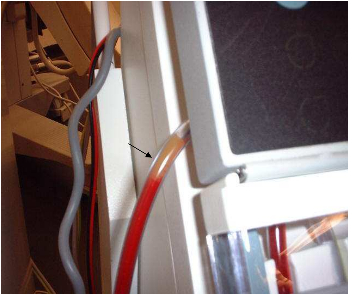
Fig. 1. Fat in the tube infusing blood from the reservoir into the blood cell separator processing bowl (arrow)

no risk for patients (figure 1). However, fat particles < 40 micron will be infused to the patient, unfiltered. A surface- or fat-filter is more effective than a screen-filter. A leukocyte filter is the most favourable (Ramirez et al. 2002, de Vries et al. 2003, 2006), but decreases reinfusion flow greatly.