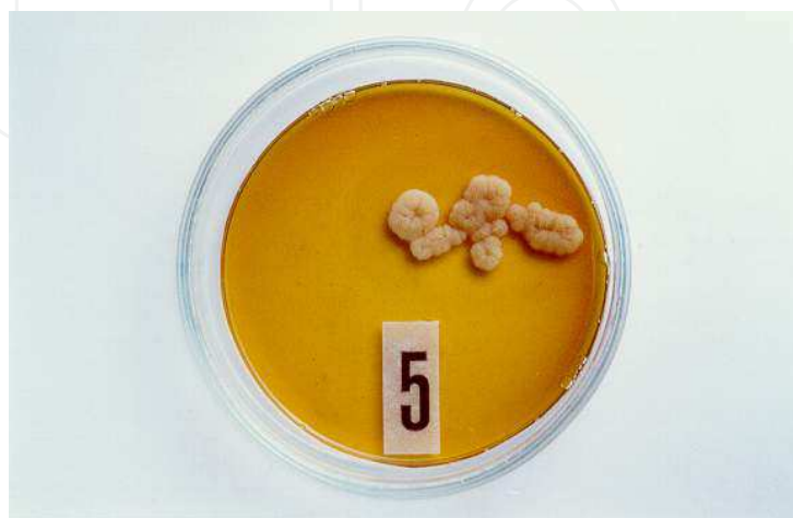
Fig. 2. The colonies of M. globosa on modified Dixon agar

The colonies of Malassezia spp. are raised, dull, creamy yellow and have a characteristic brittle texture (Figure 2). The characteristic morphological features of Malassezia yeasts include thick, multi-layered cell wall which is surrounded by a lamellar layer which contains lipids (Gueho et al., 1996).