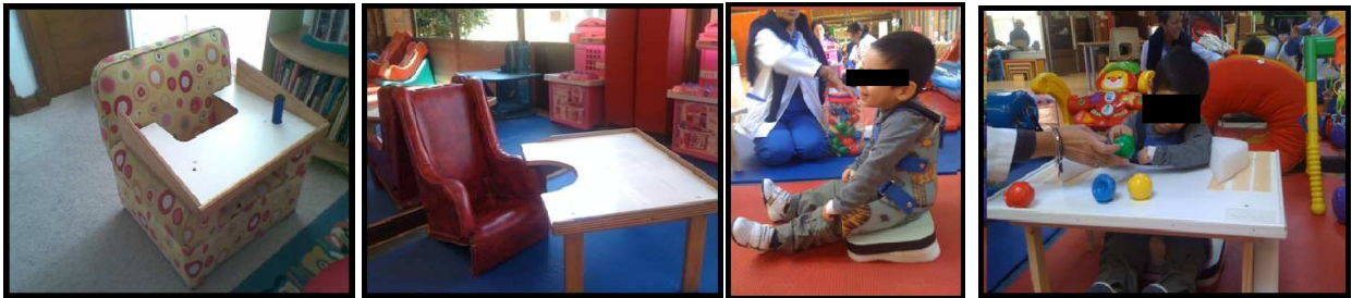
Fig. 2. Table with cutout and lateral borders; table with cutout and chair whit inclination, molded sitting, sitting and dining table with cutout molding and rear bumpers forearm

As for adapted gait (figure 5), it is important the alignment and containment of the pelvis as well as the back support to prevent extensor discharges and forearm support with or without stem to facilitate the alignment of upper body.