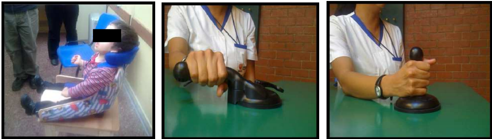
Fig. 3. Molded sitting with leg extension; Stems in prone and neutral