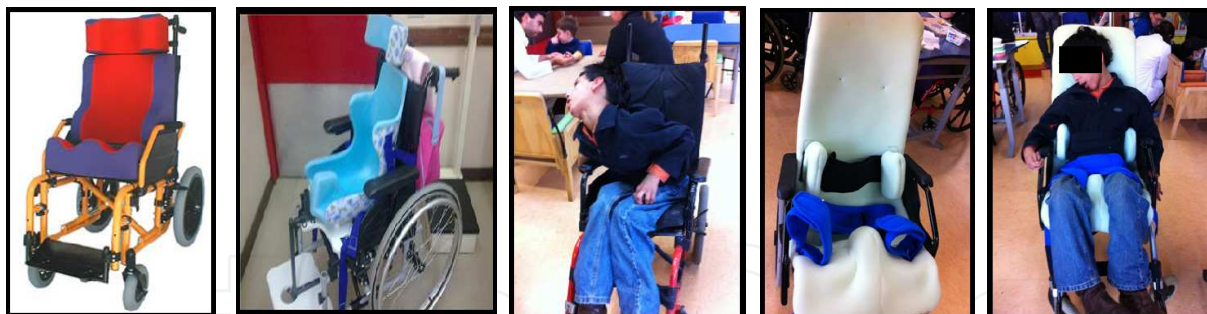
Fig. 4. Wheelchair with adapted set of cushions; wheelchair with molded sitting, wheelchair without molded sitting, molded sitting, wheelchair with molded sitting