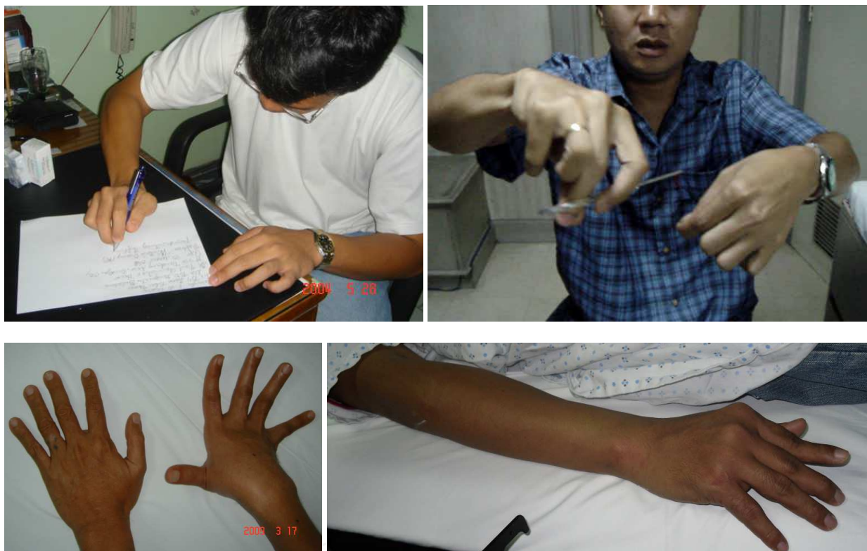
Fig. 1. Focal hand dystonias (upper panel: with task-specificity [Writer’s cramp and Barber’s cramp]); (lower panel: with complex regional pain syndrome)

BoNT) and near nerve injections (i.e. phenol block). Although useful in near large nerve injections (e.g. obturator and femoral nerves), phenol has not been encouraging because of pain associated with the procedure and its unpredictable response (27). Hinged on the abolition of abnormal muscle spasms with “sensory trick” and MAB in dystonia (i.e. applying TVR[28]), it is believed that the BoNT does have sensory modulatory effects, apart from pure muscle relaxation (see a recent review on the subject by Kanovsky and Rosales[26]). In addition, BoNT-A may reduce pain comorbidity that occur in dystonia (see a recent review by Rawicki and cohorts[29]). The fact that BoNT injections are able to improve an individual’s occupational function and quality of life elevates the rationale for its applications. The latter is best exemplified by occupational dystonias (A separate chapter is dedicated to this end). Figure-1 depicts cases of focal hand dystonias with task-specificity and those with complex regional pain syndrome, being prepared for BoNT-A injections.