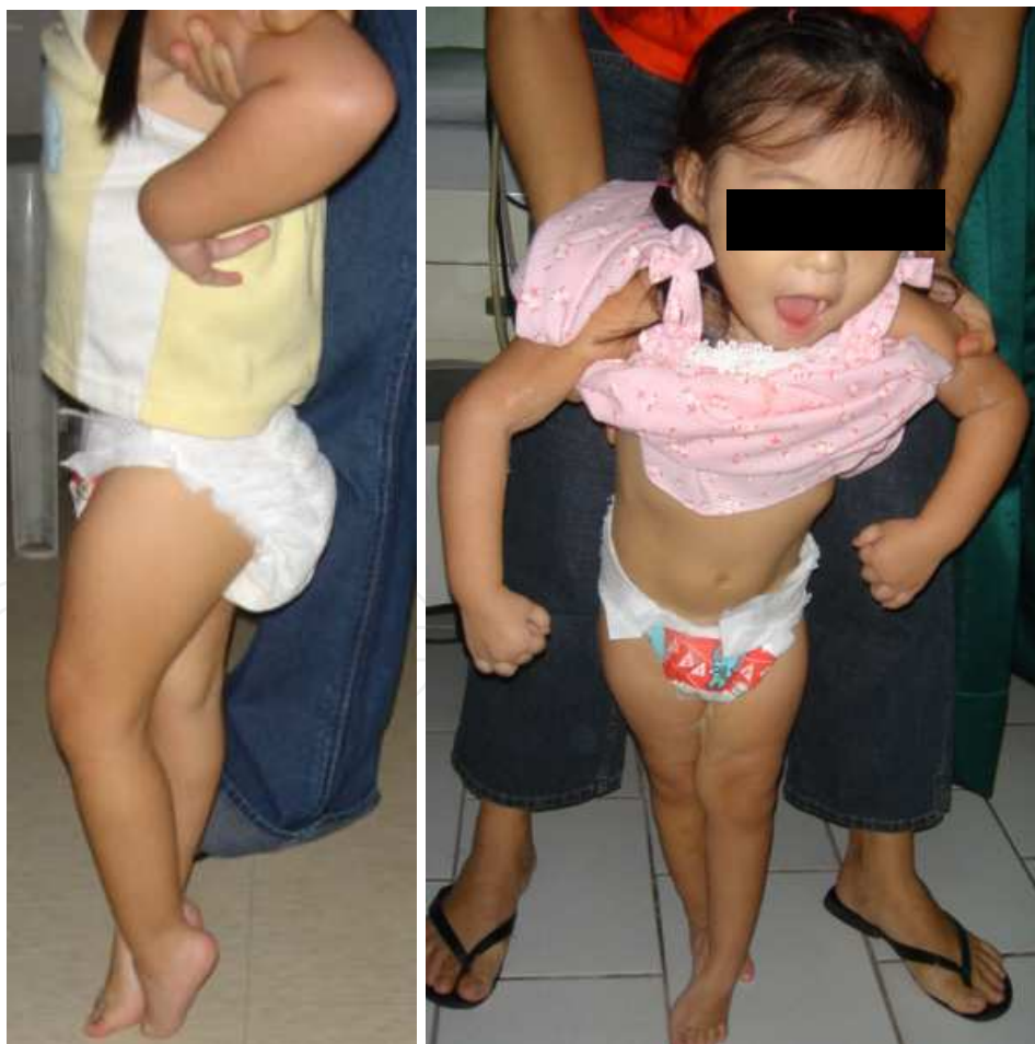
Fig. 2. Childhood spasticity (thigh adductor spasms or “scissoring” and equinovarus foot deformity)

Arguably only one component of UMN, spasticity in both children (e.g. cerebral palsy, see Figure-2) and adults (e.g. post-stroke, traumatic brain/spinal injuries and multiple sclerosis; see Figure-3), may impair one’s motor control, quality of life and may eventually lead to economic and care-giver burden. More than one third of patients develop spasticity within