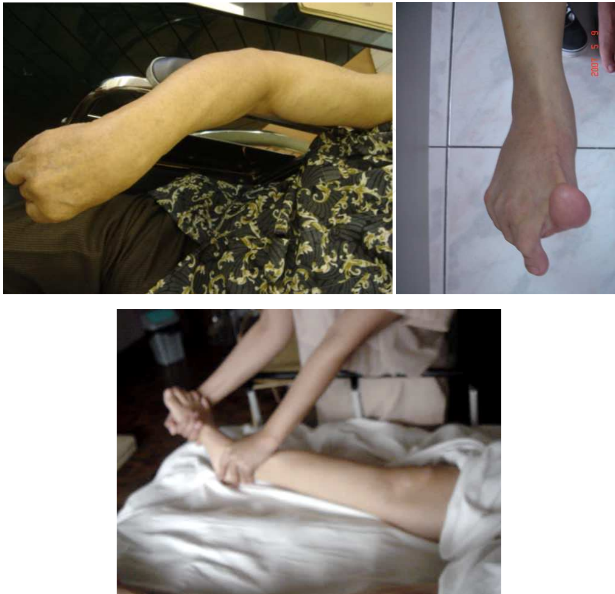
Fig. 3. Spasticity “plus” (Post-stroke with spastic dystonia-left panel; Multiple Sclerosis with spastic dystonia-middle panel; Traumatic brain injury with spasticity and dynamic contracture-right panel)

12 months after stroke(42-43) and a proportion of these patients will develop disabling spasticity requiring intervention(44). Even in the early phases of stroke (“evolving spasticity”[45]) about 19% of patients(46) or possibly more(47), develop spasticity within 3 months after the ictus. In fact, as many as 80% of patients without useful functional arm movement after the ictus, develop spasticity (measured by muscle activation recording) within 6 weeks of first stroke(48).