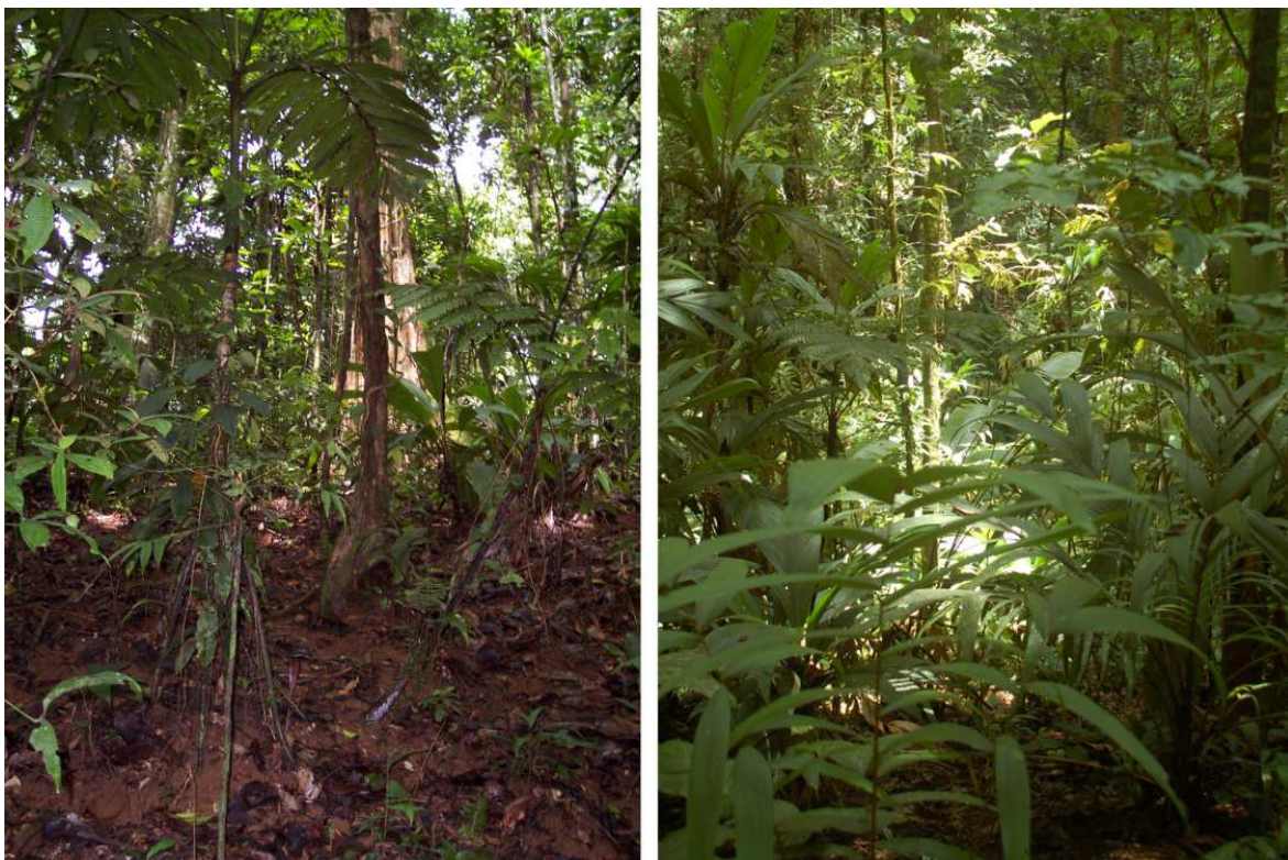
Fig. 3. Understory vegetation density at La Selva Biological Station, Costa Rica, is lower in areas exposed to collared peccaries (left) than within experimental peccary exclosures (right).