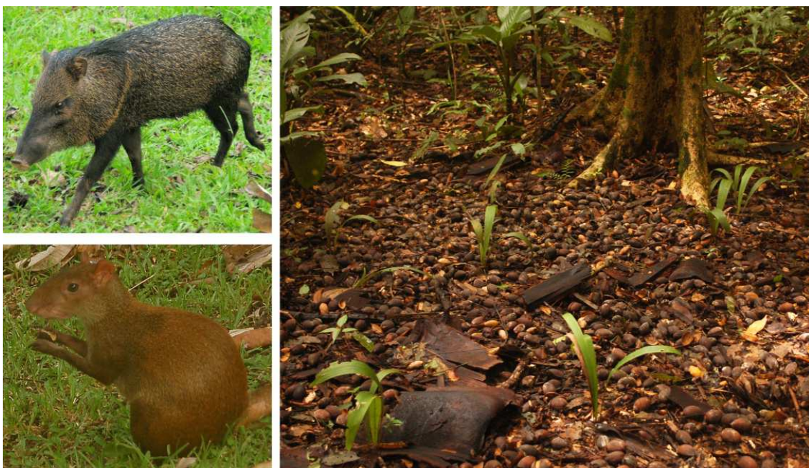
Fig. 2. Collared peccary ( Pecari tajacu ; top left), Central American Agouti ( Dasyprocta punctata ; bottom left), and a carpet of undispersed Attalea butyraceae fruits at a heavily hunted site in Parque Nacional Camino de Cruces, Panama.