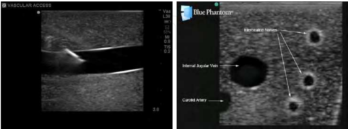
Fig. 1. Central Line Trainers.

http://www.bluephantom.com/details.aspx?pid=51&cid=