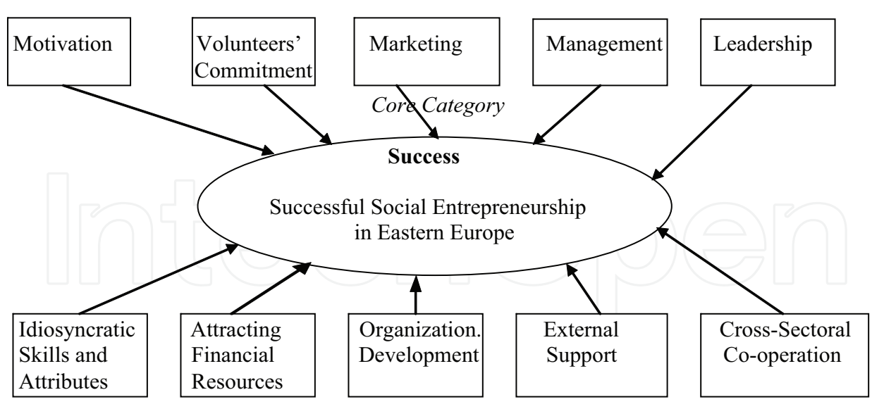
Fig. 1. Successful Social Entrepreneurship in Eastern Europe