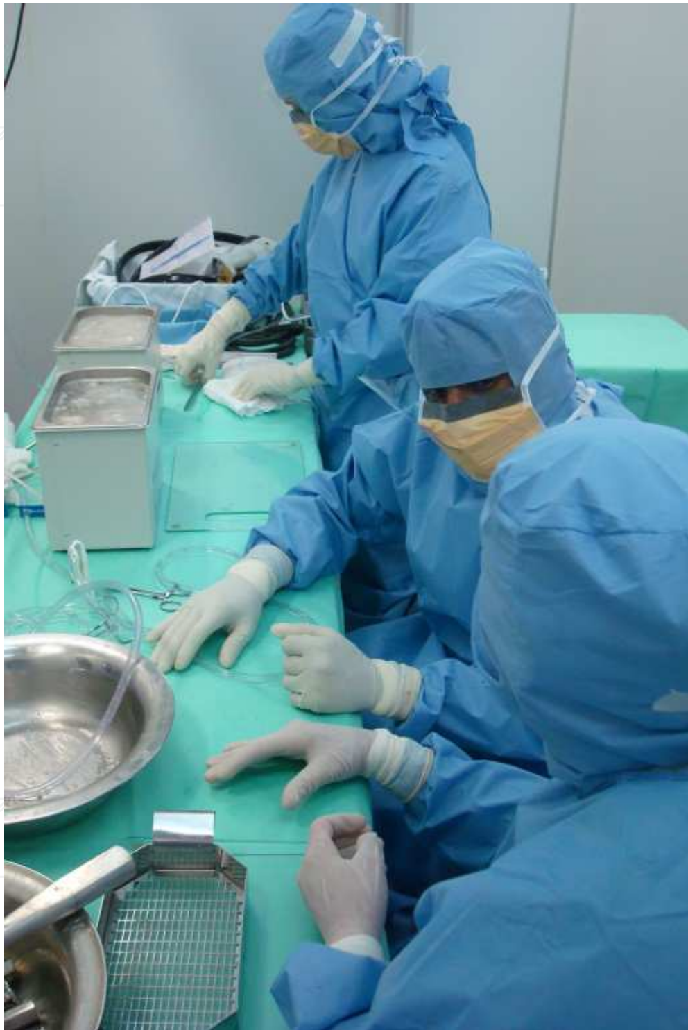
Fig. 4. Processing team in activity in the controlled área (ISO 5: Class 100).

of the nursing staff that performs the procedure, but also other professionals who access the environment (cleaning maintenance).