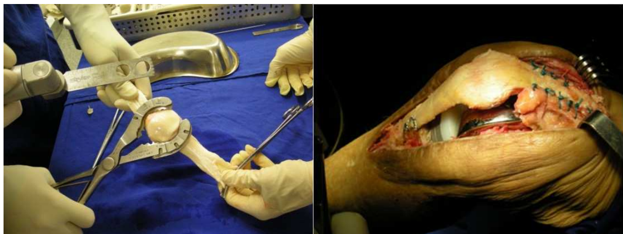
Fig. 6. and 7. Patellar tendon allograft transplant.

By the time of transplantation, all tissues processed are subjected to rigorous quality assurance criteria. It requires the evaluation of all data pertinent to the donor, test results, maintenance and control of equipment, materials and instruments used in all phases of each procedure (Figures 6 and 7).