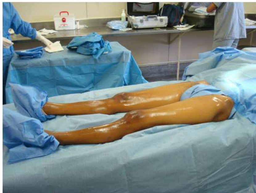
Fig. 1. Pre-operative preparation of the potential musculoskeletal tissues donor.

A very important step of the process of capture is the reconstruction of the donor and for this matter we use prosthesis specially designed using plaster, wire suture, gauze. This reconstruction is done rigorously and is characterized as the most laborious phase of the procedure. All anatomical parameters are respected, and therefore the deformation of the donor does not occur (Figures 1 and 2).