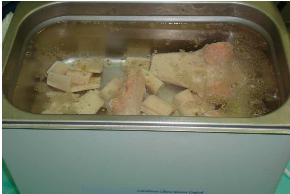
Fig. 5. Tissue's chemical processing. Ultrasonic clining with emulsifying solution.

adventitial tissue such as blood, periosteum, subcutaneous tissue, muscle, fascia and fibrotic tissue. Then, these tissues are immersed in emulsifying solutions based on hydrogen peroxide and alcohol under ultrasonic agitation (Figure 5).