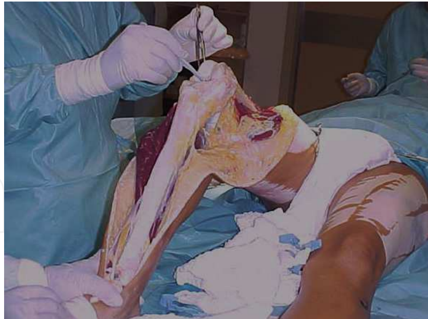
Fig. 2. Tissue removal: bone and tendon dissection under aseptic conditions.